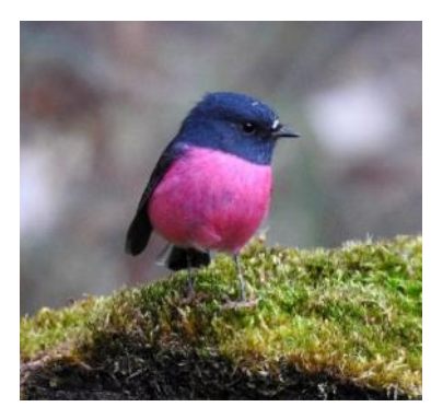
Day Tour Forest and woodland birds of Hobart