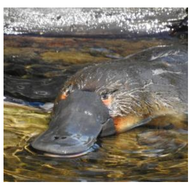
Day Tour Mt Field National Park and the Derwent Valley