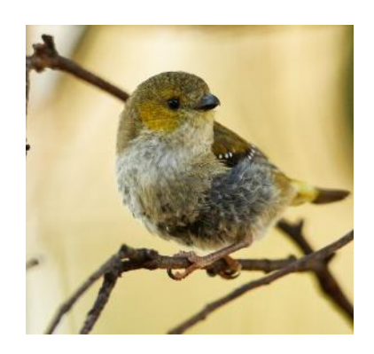
Day Tour Hobart to Bruny Island and return