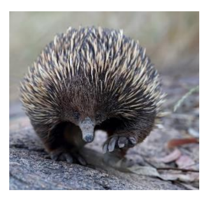
1 DAY TOUR PACKAGE: Full day & Night tour