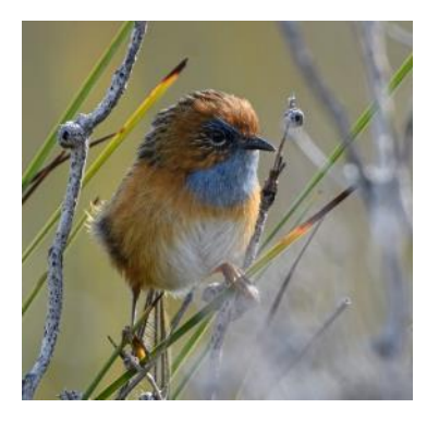
Day Tour Southern Forests and Coast