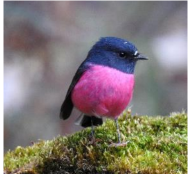
FULL DAY TOUR