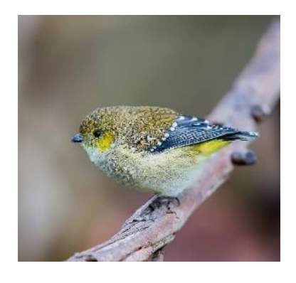
PROPERTY TOUR: Walking the Inala Nature Reserve