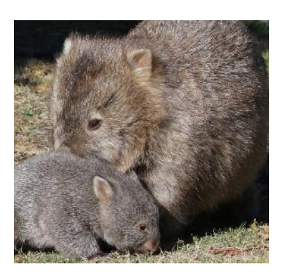
Day Tour Maria Island National Park