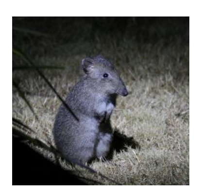
Hobart Night Tour