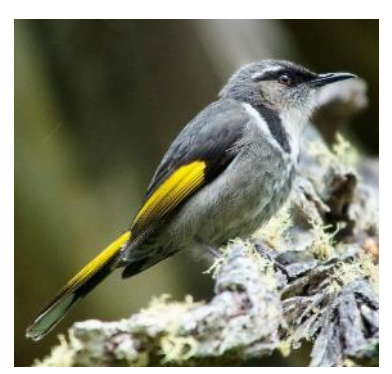
Day Tour Hartz Mountains