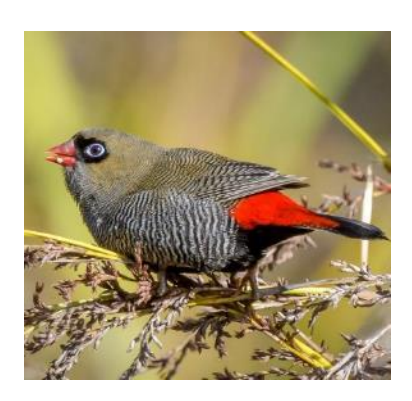
2 DAY TOUR PACKAGE: 2 X Full day & Night tours