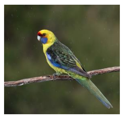
Day Tour Tasmanian Endemic birds of the Hobart area