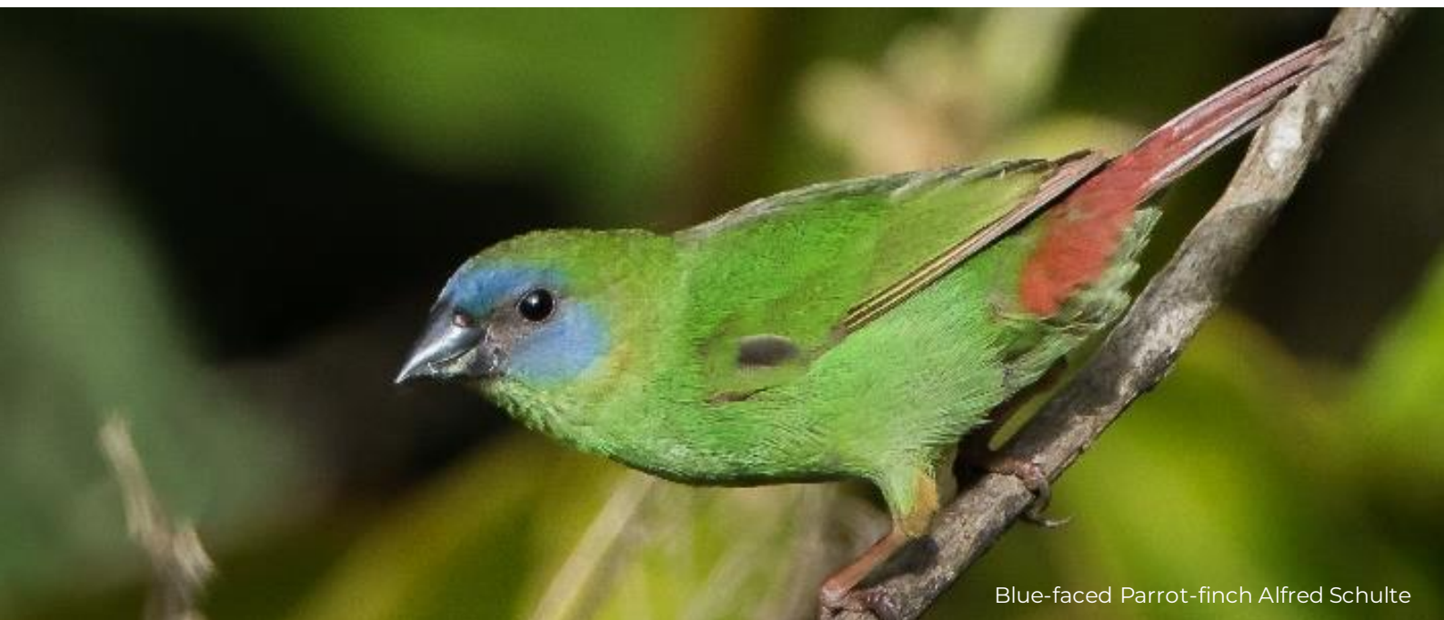
Blue-faced Parrot-finch Alfred Schulte

Accommodation: Portland Roads (shared toilet/bathroom). Meals included: B L D