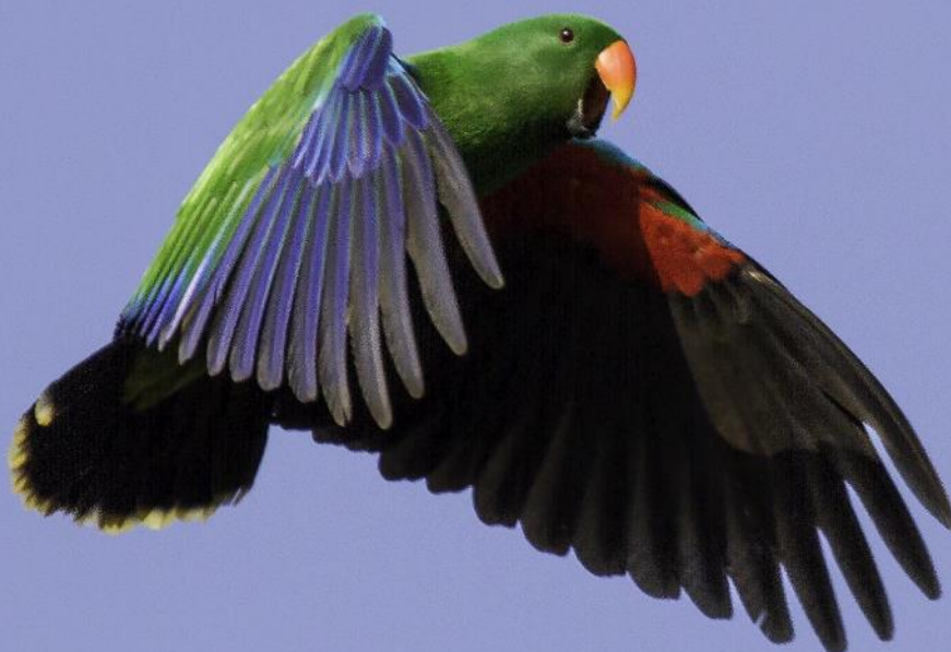
Eclectus Parrot - Alfred Schulte