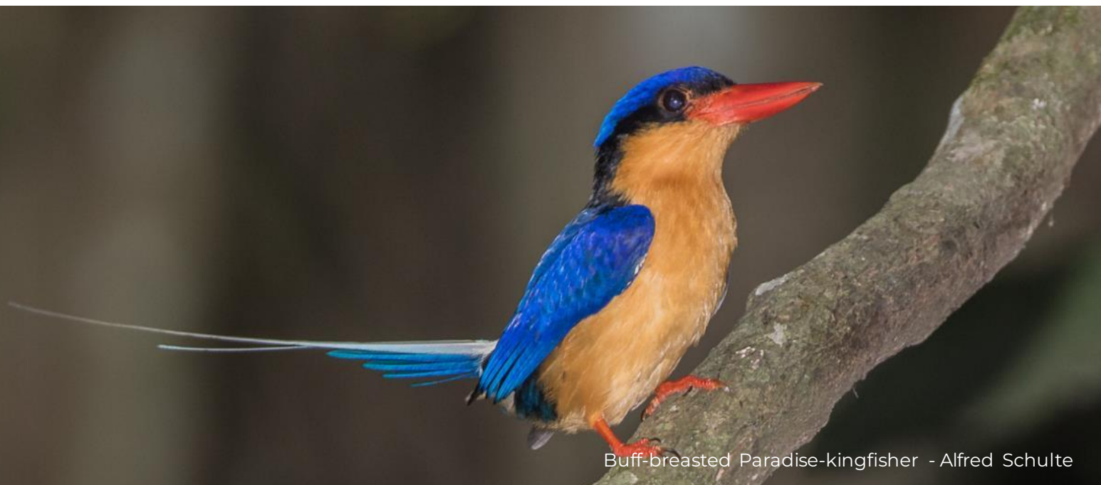
Buff-breasted Paradise-kingfisher

Around the Wet Tropics area our main target is Blue-faced Parrot-finch , at that time of year found in the highland rainforests. Here we will also look for other high-altitude specialties like Golden Bowerbird , Victoria's Riflebird , Tooth-billed Bowerbird , Bridled Honeyeater and Fernwren , amongst others.