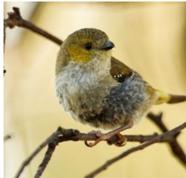
Day Tour Hobart to Bruny Island and return