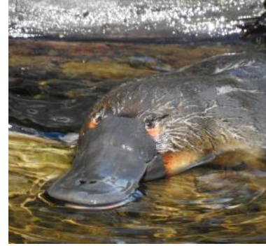
Day Tour Mt Field National Park and the Derwent Valley