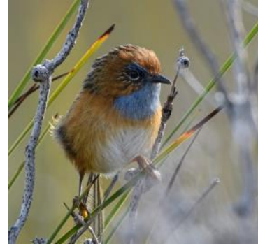
Day Tour Southern Forests and Coast