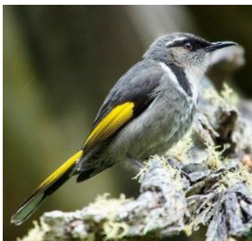
Day Tour Hartz Mountains