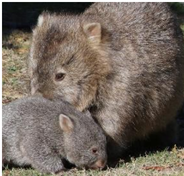
Day Tour Maria Island National Park