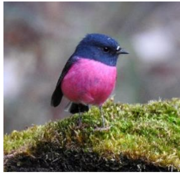
Day Tour Forest and woodland birds of Hobart