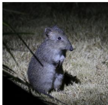
Hobart Night Tour