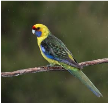
Day Tour Tasmanian Endemic birds of the Hobart area