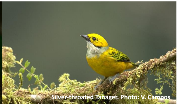
Silver-throated Tanager.

Day 14. Caño Negro wetlands to San José. After an early breakfast we will travel back to San José (a total travel time of around 3 hours). As we ascend from the lowlands, we will stop at another feeding station, where birds like Northern Emerald-toucanet, Silver-throated Tanager, Red-headed Barbet and many others are regular visitors. We will have lunch at La Paz Waterfall Gardens, which located at a mid to high elevation, is a regular stop for many hummingbirds and other bird species that live at this altitude. This is also a great place to see a huge variety of butterflies. After enjoying a buffet lunch, we will continue to explore this area, walking a trail where six incredible waterfalls cut through the mountain. We will then head to San José for our final dinner together. Accommodation: Hotel in San José (en suite rooms) as for last night. Meals: B, L, D.