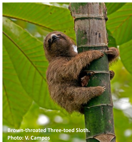
Brown-throated Three-toed Sloth.

Day 3. Pacific Lowlands – Carara National Park. After some early birding and breakfast at the lodge, we will transfer to Carara National Park, a short drive away. This area is a transition zone between the rainforest of the Pacific coast and the dry forests of the north, with the shift between them marked by the meandering Tárcoles River. We will spend the whole day in the National Park. Carara is home to an astounding diversity of flora and fauna, including the spectacular Scarlet Macaw, and Central American specialities including Orange-collared, Red-capped and Golden-hooded Manakins, Crimson-fronted Parakeet, and Brown-headed and White-crowned Parrots. The area is also rich in mammals, and we will keep a look out for Mantled Howler Monkeys, White-faced Capuchin Monkeys, Brown-throated Three-toed Sloth and Collared Peccary. Accommodation: Villa Lapas as for last night (en suite rooms). Meals: B, L, D.