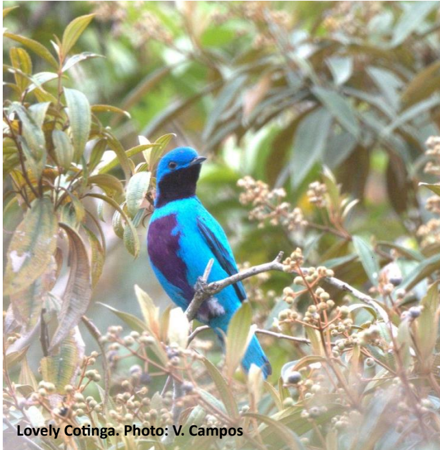
Lovely Cotinga.

Day 8. Rainforest on the Caribbean Slope: El Copal. After some pre-breakfast birding and breakfast at the lodge, we will travel to a magic place called El Copal private reserve (around 1 hour total travel time), where we will bird mostly from the balcony to see birds like Speckled Tanager, Bay-headed Tanager, Black-and-yellow Tanager, Snowcap Hummingbird and if we are lucky, Lovely Cotinga, which certainly lives up to its name. We will have lunch at El Copal while birding, before returning to our hotel for dinner. Accommodation: Hotel Quelitales in the Orosi Valley (en suite rooms) as for last night. Meals: B, L, D.