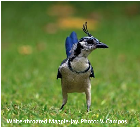
White-throated Magpie-jay.

Day 1. Arrive San José International airport, Costa Rica. We will be met on our arrival at the San José International Airport in Costa Rica and taken to our hotel. Free time to explore the hotel's lush gardens, where we have a chance of spotting Crimson-fronted Parakeet, Boat-billed Flycatcher, Groove-billed Ani, and several species of hummingbird, or just relax until we meet for a welcome dinner at the hotel this evening. Accommodation: San José hotel (en suite room). Meals: D.