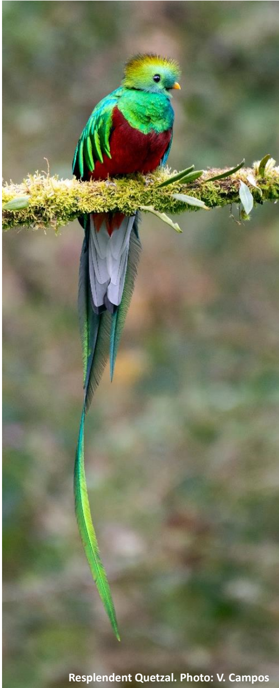
Resplendent Quetzal.

Day 4. Pacific Lowlands – Boat cruise Tárcoles River. After more pre-breakfast birding and breakfast at the lodge, we will head out to the surrounding forest to explore further. Around mid-afternoon we will take a boat cruise on the Tárcoles River to look for a variety of water birds, including Amazon Kingfisher, Bare-throated Tiger-heron and Boat-billed Heron, tiny Mangrove Swallow and Magnificent Frigatebird, plus Scarlet Macaws which roost in the mangroves. Mangrove Hummingbird, Mangrove Warbler, Mangrove Yellow Warbler are also possible. We will return to our lodge for a third night. Accommodation: Villa Lapas as for last night (en suite rooms). Meals: B, L, D.