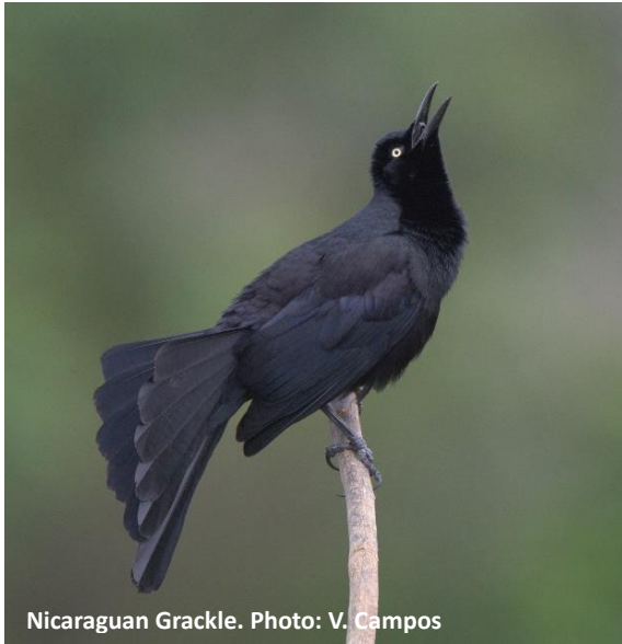
Nicaraguan Grackle.

Day 12. Caribbean Lowlands to Caño Negro wetlands: Wildlife Refuge and Los Chiles. After our customary pre-breakfast birding and breakfast at our hotel, we will travel to Caño Negro Wildlife Refuge (a total travel time around 3 hours), which is one of the best places in Costa Rica to see and photograph birds, monkeys, caimans, iguanas, Green Basilisk and more. Located in the north of Costa Rica, this is home to a particular bird species, the Nicaraguan Grackle, which is endemic to this small area of Central America. During the day we will board pontoon boats, which will take us out on the Medio Queso wetland (which translates to 'half of a cheese') near the township of Los Chiles to look for Jabiru, Lesser Yellow-headed Vulture, Sungrebe, Nicaraguan Seed-finch and Yellow-breasted Crike. We will have dinner at our lodge this evening. Accommodation: Natural Lodge , Caño Negro (en suite rooms). Meals: B, L, D.