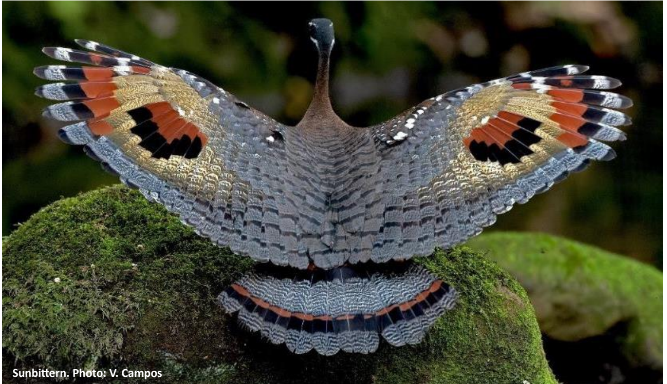
Sunbittern.