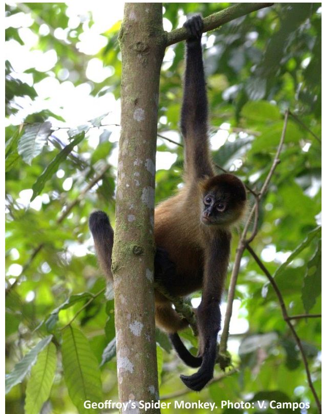
Geoffroy's Spider Monkey.