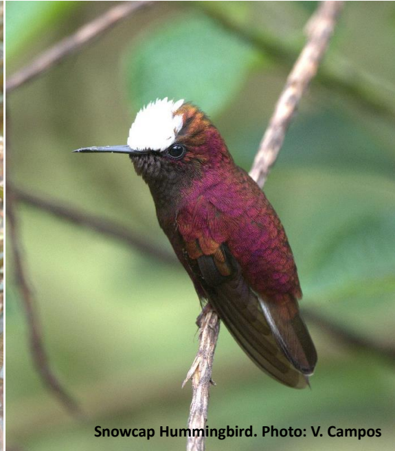
Snowcap Hummingbird.

Day 9. Caribbean Slope to Caribbean Lowlands. After breakfast we will depart for our next destination, the Caribbean Lowlands (a total travel time of around 4 hours). Heading east across the central mountain range, we encounter different landscapes and a different suite of birds, mammals, reptiles and amphibians. We will arrive at our lodge for dinner this evening. Accommodation: La Quinta Lodge , Sarapiquí (en suite rooms). Meals: B, L, D.