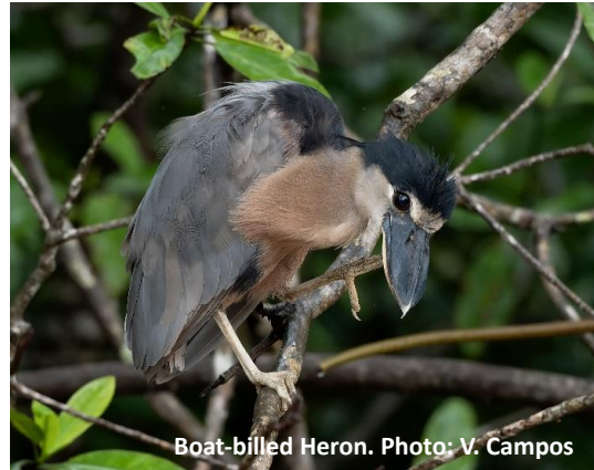
Boat-billed Heron.