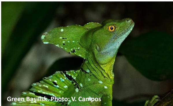
Green Basilisk.

Day 13. Caño Negro Wildlife refuge. We will spend all day in this area today. This morning, we will take a boat cruise on Rio Frio River where we expect to see a myriad of wildlife, including Spectacled Caimans, Green Basilisk, Black River turtles, monkeys and many water birds. We will return to the hotel briefly for lunch, before heading out again on our boats to continue exploring this area. Accommodation: Natural Lodge, Caño Negro (en suite rooms) as for last night. Meals: B, L, D.