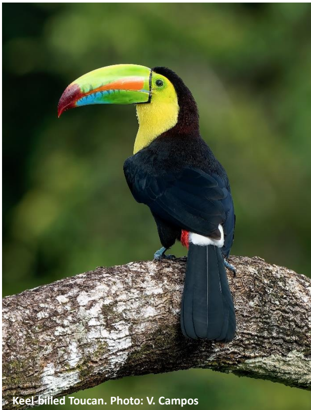
Keel-billed Toucan.