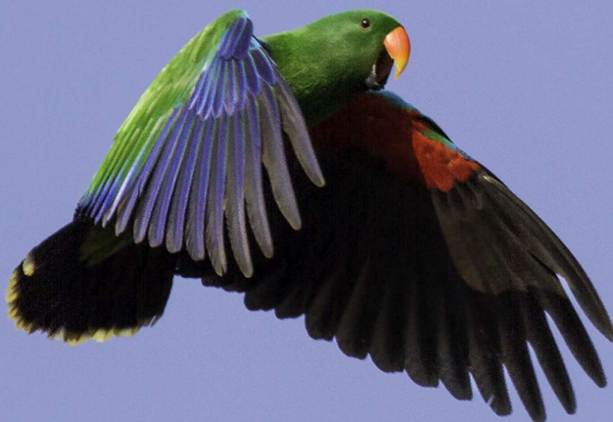
Eclectus Parrot - Alfred Schulte