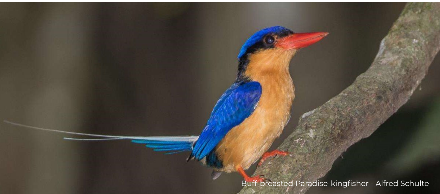
Buff-breasted Paradise-kingfisher

Around the Wet Tropics area our main target is Blue-faced Parrot-finch , at that time of year found in the highland rainforests. Here we will also look for other high-altitude specialties like Golden Bowerbird , Victoria's Riflebird , Tooth-billed Bowerbird , Bridled Honeyeater and Fernwren , amongst others.