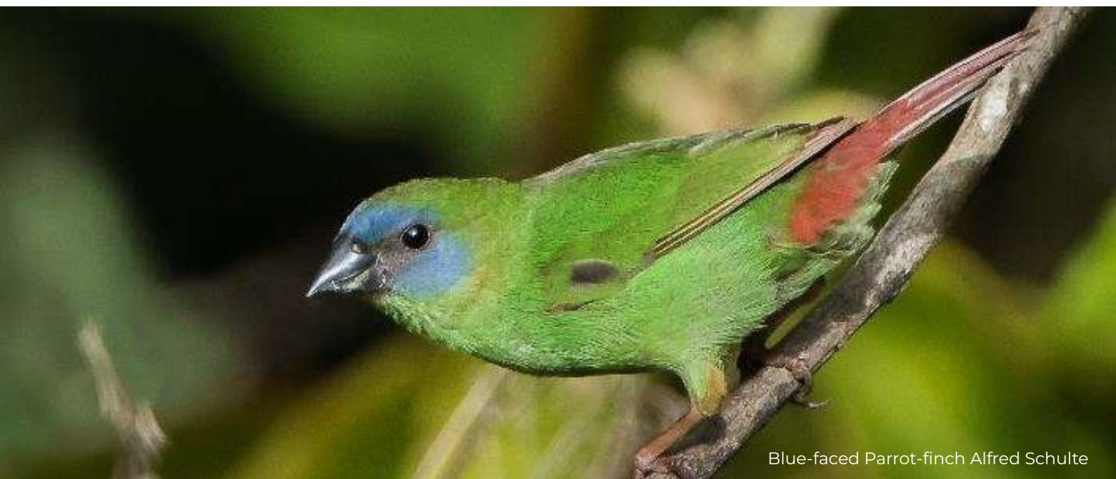
Blue-faced Parrot-finch Alfred Schulte

At night we can try for Lesser Sooty Owl and possibly the rainforest-inhabiting lurida race of