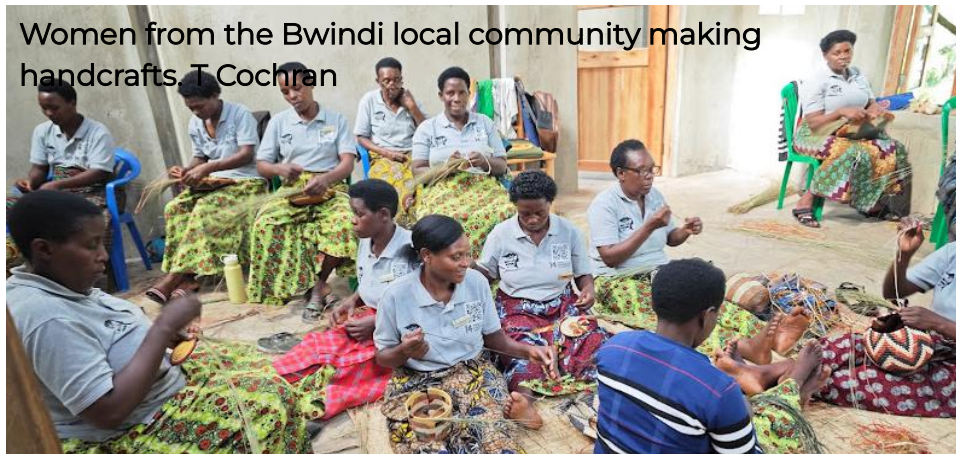
Women from the Bwindi local community making handcrafts.

African Broadbill, Banded Prinia and the handsome Black-faced Rufous-Warbler. The mid-storey and canopy support Elliot's and Tullberg's Woodpeckers, Cabanis', Kakamega and Anson's Greenbuls, the strange Grauer's Warbler and White-browed Crombec. The rare Jameson's Antpecker may also be seen probing under moss on dead branches or gleaning warbler-like in the canopy. Overhead, Scarce Swifts forage over the forest. Birding at Buhoma is a truly magical experience. Other wildlife that we may be fortunate enough to find here include the huge Yellow-backed Duiker, Mantled Guereza, the rare L'Hoest's, Monkey, restricted to the Albertine Rift and Congo Basin, Blue and Red-tailed Monkeys, Chimpanzee and several species of Squirrels including Fire-footed Rope, Carruthers' Mountain, Ruwenzori Sun and Red-legged Sun Squirrel.