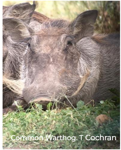
Common Warthog. T Cochran

Day 14. Boat ride Lake Mburo NP. This morning after breakfast, we will have a morning game drive in the National Park looking for mammals including Plains Zebra, Impala, Eland, Topi and African Buffalo. We will also look for birds like Trilling and Tabora Cisticola, Crested, Spot-flanked, Black-collared and Red-faced Barbet and Red-necked Spurfiowl. In the afternoon, we will have a boat trip looking for bird specialties and other mammals in the Park, especially the rare African Finfoot, Giant, Pied and Shining-blue Kingfishers, and Black-crowned and White-backed Night-herons. Accommodation: Tented camp (en suite tents) in Lake Mburo National Park as for last night. Meals: B, L, D.