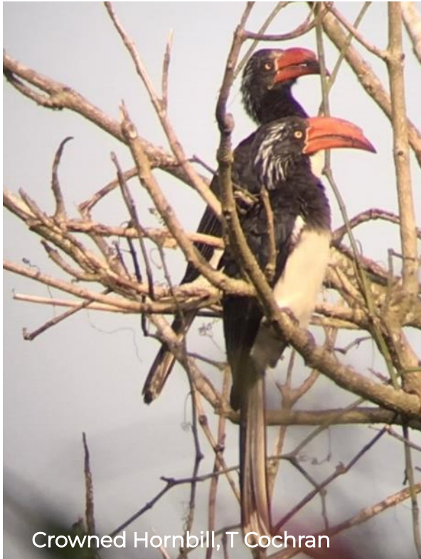
Crowned Hornbill, T Cochran

Day 16. No activities are planned for today so that you can make your own arrangements for your departure flight to onward destinations. But for those with later departure flights, we will spend some time birding in the botanic gardens, which host a plethora of bird species including Ross's and Great Blue Turaco, Crowned Hornbill, Black-and-white-Casqued Hornbill, Ruppell's Starling, Splendid Starling, Grey Parrot and a variety of bee-eaters and sunbirds.