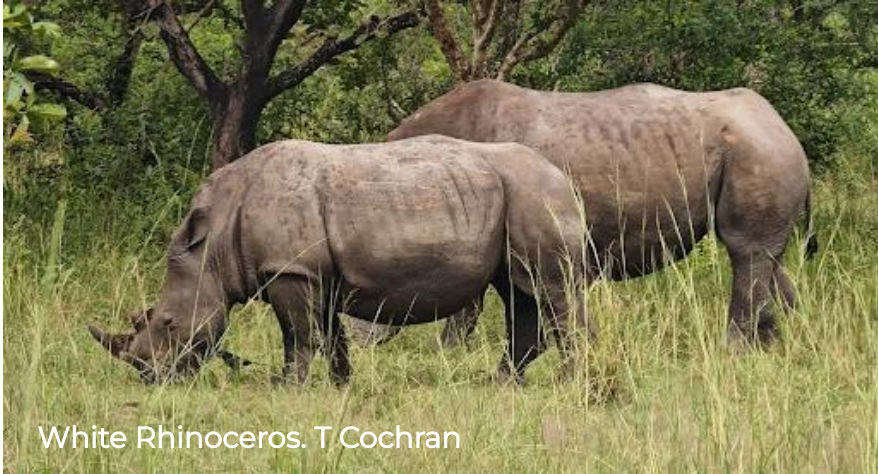
White Rhinoceros. T Cochran

Day 3. White Rhinoceros tracking and Murchison Falls National Park. After breakfast, we will