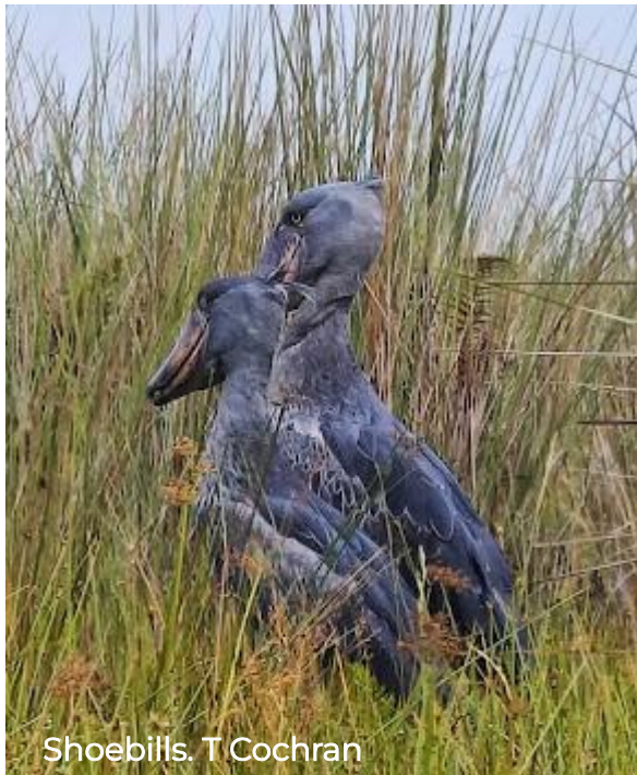
Shoebills. T Cochran

Day 2. Shoebills and White Rhinoceros reserve. After an early breakfast, we will travel to some