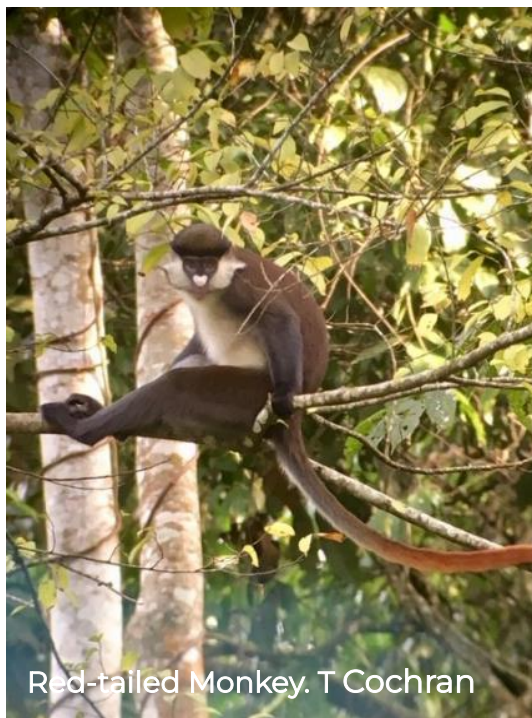
Red-tailed Monkey. T Cochran

Accommodation: B&B near Kibale National Park. (en suite rooms) as for last night. Meals: B, L, D.