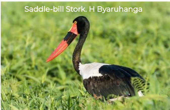
Saddle-bill Stork. H Byaruhanga

winged and Standard-winged Nightjars. Accommodation: Safari Lodge (en suite rooms) within the Murchison Falls National Park as for last night. Meals: B, L, D.