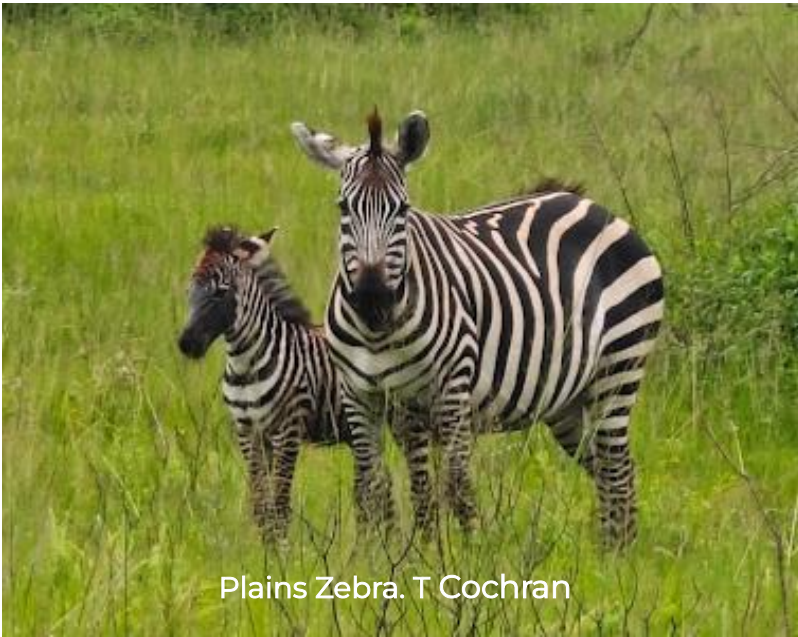
Plains Zebra. T Cochran