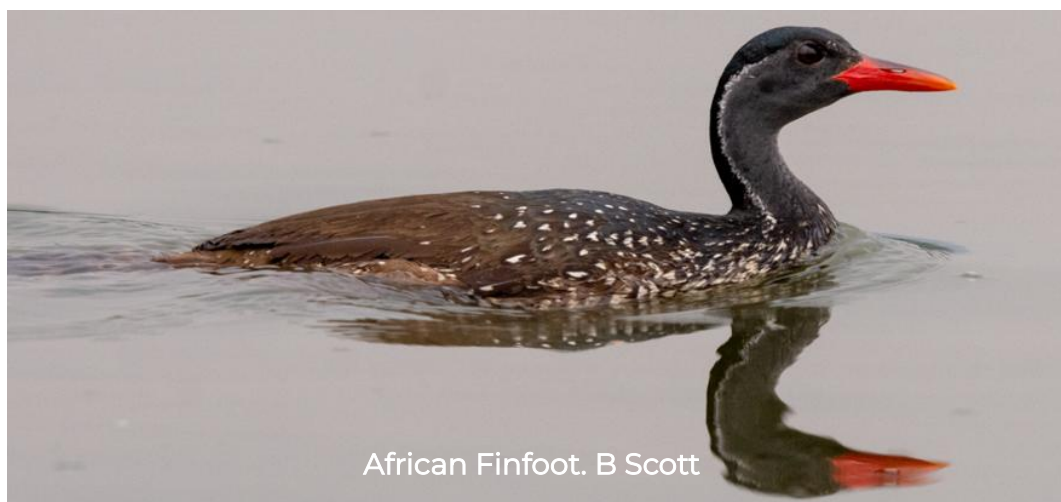
African Finfoot. B Scott

Day 15. Lake Mburo to Entebbe. After an early breakfast, we will take another morning game drive in search of some species we may have missed the previous day and drive out of the park. We will make a stop at the Equator en route for photographs and continue back to Entebbe during the afternoon. Tonight, we will have a farewell dinner and reminisce about the amazing and life-changing experiences we have had on this trip. Accommodation: Hotel in Entebbe (en suite rooms). Meals: B, L, D.