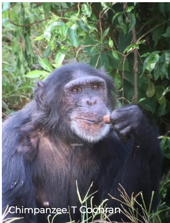
Chimpanzee.

Day 8. Kibale to Queen Elizabeth National Park. After breakfast, we will travel to Queen Elizabeth National Park. The Park, which is named after the Queen of England who visited it in 1954, is the second largest national park in Uganda. Queen Elizabeth National Park boasts the highest biodiversity of any game reserve in the world and the habitat is comprised of a mix of open savannah, rainforest, dense papyrus swamps, crater lakes and the vast Lake Edward. Queen Elizabeth National Park is home to almost 100 mammal species and a remarkable 612 bird species, making it a superb safari territory, with Bush Elephants, a profusion of Hippopotamus, elusive Giant Forest Hog and handsome Uganda Kob all regularly sighted around the village on the Mweya Peninsula. The area also boasts a marvellous waterfront setting in the shadow of the Rwenzori Mountains. Accommodation: Safari Lodge (en suite rooms) within the Queen Elizabeth National Park. Meals: B, L, D.