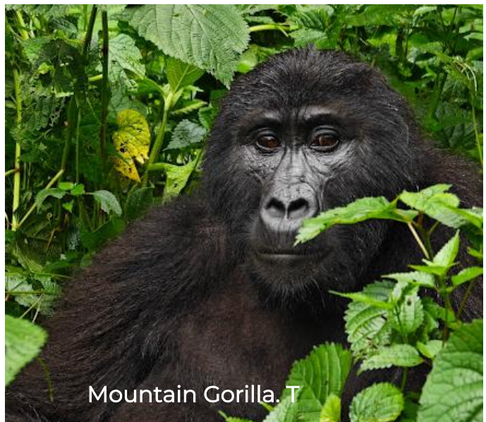
Mountain Gorilla. T