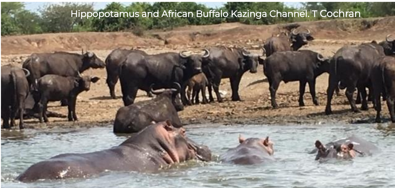
Hippopotamus and African Buffalo Kazinga Channel. T Cochran

Birding here is excellent with great photographic opportunities. Congregations of African Skimmers, Great-white and Pink-backed Pelicans, Great and Long-tailed Cormorants, Open-billed Stork, African Skimmer, White-faced Whistling Duck, Marsh, Wood and Common Sandpipers, Malachite Kingfisher, African Jacana, African Wattled Plover can all be found here. Accommodation: Safari Lodge (en suite rooms) within the Queen Elizabeth National Park as for last night. Meals: B, L, D.