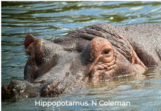
Hippopotamus.