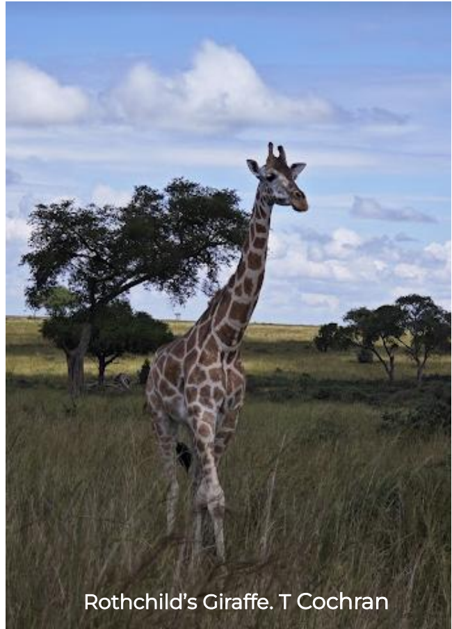
Rothchild's Giraffe. T Cochran

Day 5. Murchison Falls to Masindi. After breakfast we shall cross the Murchison River and drive to Masindi through the escarpment. We shall also pass through a section of Budongo Forest Reserve which is a good location for species such as the Rufous-crowned Eremomela, Chocolate-backed Kingfisher, Ituri Batis, Puvel's Illadopsis, Lemon-bellied Crombec, White-thighed Hornbill and many more. Accommodation: Hotel in Masindi (en suite rooms). Meals: B, L, D.