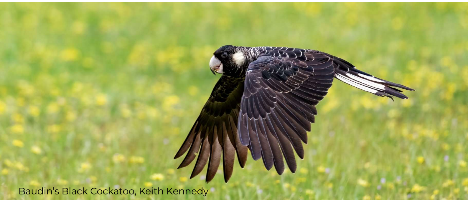
Baudin's Black Cockatoo, Keith Kennedy

Accommodation: Cheynes Beach (en suite rooms). Meals included: B, L, D.