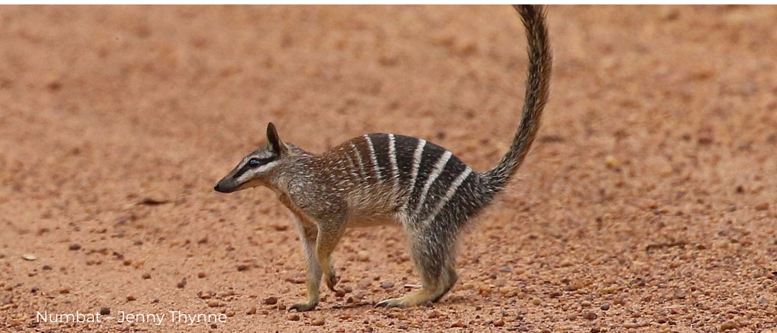
Numbat