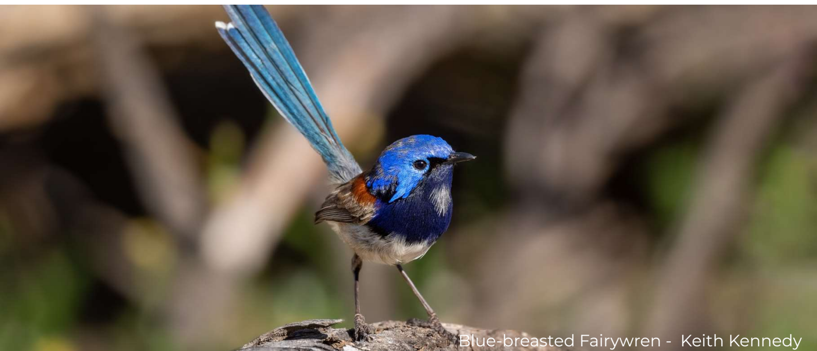
Blue-breasted Fairywren - Keith Kennedy

We depart after an early breakfast for Dryandra State Forest. We probably will not return until about 22:30. The key targets today include Bush Stone-curlew, Painted Button-quail, Carnaby's Black Cockatoo, Elegant Parrot, Rufous Treecreeper, Blue-breasted Fairy-wren, Western Thornbill, Yellow-plumed Honeyeater, Brown-headed