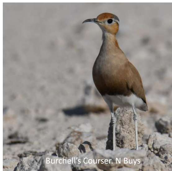
Burchell's Courser.

We will scan the plains north of Brandberg for Rüppell's Korhaan, Burchell's Courser, Bokmakierie and Benguela Long-billed Lark. The hills will hopefully produce Herero Chat, arguably the toughest of the desert endemics to find. Yellow-bellied Eremomela, Cape Penduline Tit and Grey-backed Cisticola can also be seen here. Our tranquil lodge is situated close to the Ugab River where we hope to see Violet Woodhoopoe and Bare-cheeked Babbler. Rüppell's Parrot and Augur Buzzard can be found here as well. Sometimes the desert-adapted wildlife come right up to the lodge! We will enjoy a traditional Namibian dinner and then head off to bed. Accommodation: Safari lodge at Brandberg (en suite rooms). Meals: B, L, D.