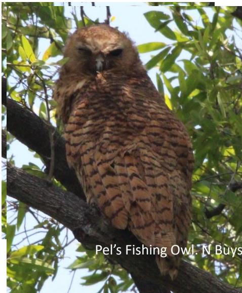
Pel's Fishing Owl. N Buys

Days 7 & 8. Friday 28 & Saturday 29 March 2025. Divundu, Namibia. Today we return to Namibia, but