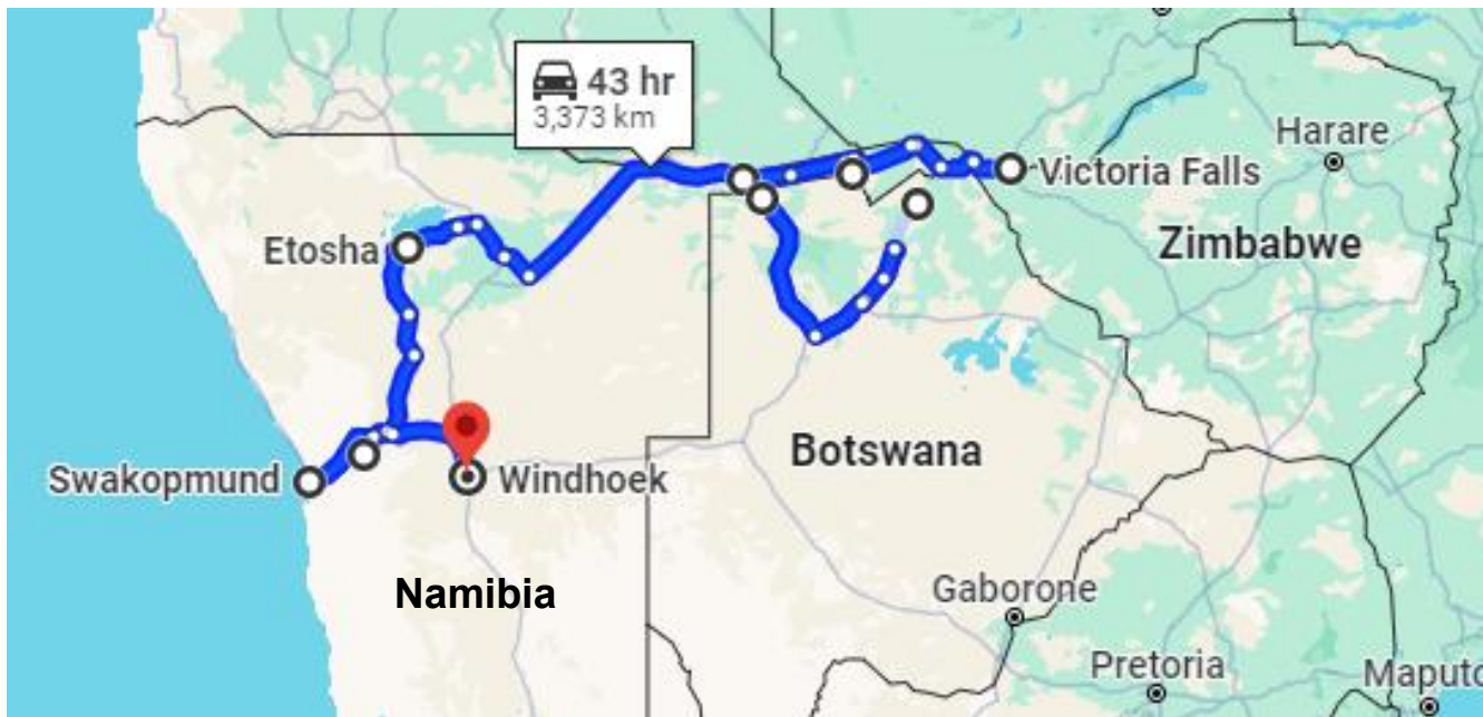
Enlargement of the area covered by the tour: