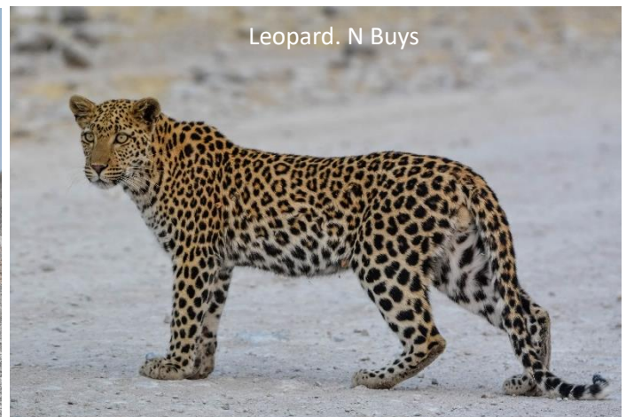
Leopard. N Buys

We could also see African Elephant, Lion, Black Rhinoceros, Giraffe, Cheetah, Spotted Hyaena, Leopard, Black-backed Jackal, Black-faced Impala (another endemic subspecies), Hartebeest (Red subspecies), Gemsbok (Namibia's national animal), Greater Kudu, Springbok, and many smaller mammals during our stay in the park. Our accommodation for the next two nights is in a 4,000-hectare private nature reserve that borders the national park. Expect to see birds and other wildlife over breakfast! Accommodation: Safari lodge at Etosha East (en suite rooms) for two nights. Meals: B, L, D each day.