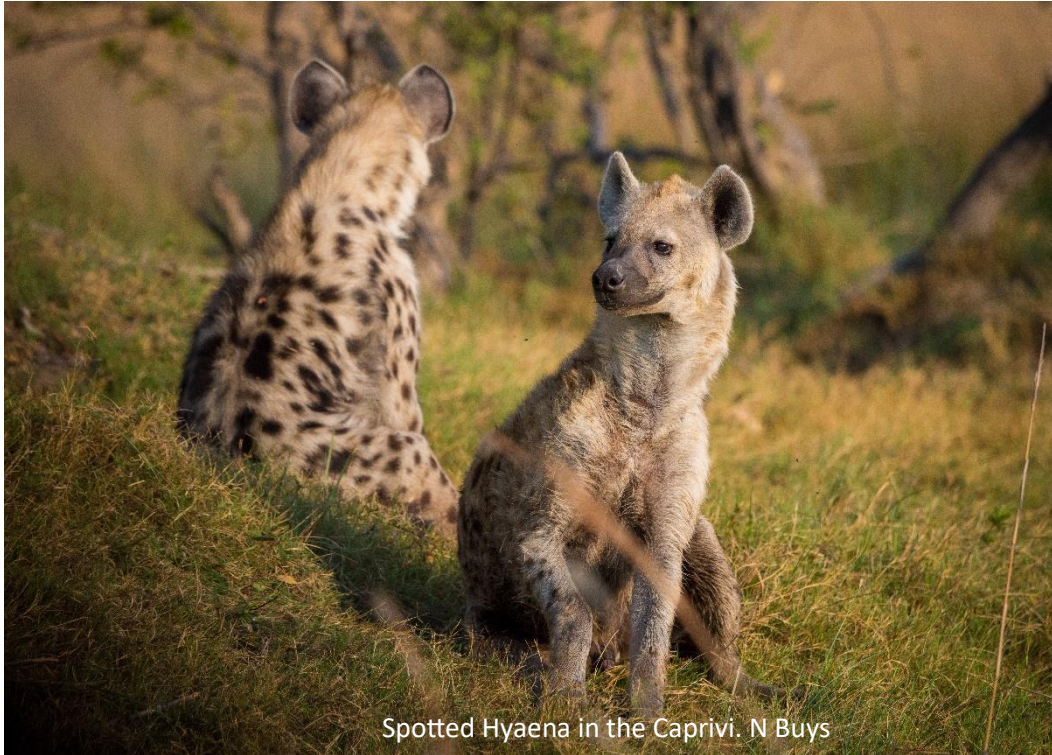
Spotted Hyaena in the Caprivi.

450 km long and 32 km wide) was named after German Chancellor Leo von Caprivi, who negotiated the acquisition of the land in an 1890 exchange with the United Kingdom. Intending to give Germany access to the Zambezi River and a direct route to Africa's east coast, where the colony of German East Africa (now part of Tanzania) was situated, the plan failed because Victoria Falls made