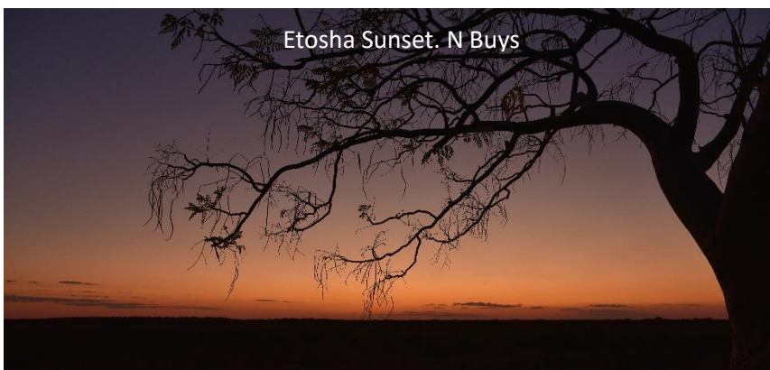
Etosha Sunset. N Buys

Ground Squirrel. After dinner, we will walk to the famous floodlit waterhole in the camp, where we can relax and look for Verreaux's Eagle-owl, Western Barn Owl, and Rufous-cheeked Nightjar come for a drink. There might also be Black Rhinoceros, African Elephant, Giraffe, Gemsbok, Greater Kudu, Springbok, and Common Warthog. Accommodation: Safari lodge (en suite rooms) at Etosha South for 2 nights. Meals: B, L, D each day.