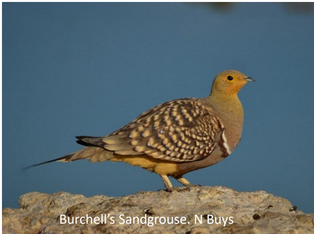
Burchell's Sandgrouse. N Buys

Days 11 & 12. Tuesday 1 & Wednesday 2 April 2025. Etosha South, Namibia. In the morning, we will make our way westwards, stopping at waterholes during our drive. We will have lunch at Halali camp, known for sightings of Violet Woodhoopoe, Carp's Tit, Bare-cheeked and Southern Pied Babbler, White-crested Helmetshrike, Damara Red-billed Hornbill, Greater Blue-eared Starling, African Scops Owl, and Southern White-faced Owl. If there is time, we will take a short stroll to the local waterhole to see what mammals are visiting. On our way to our next lodge at Okaukuejo camp, we may see Dusky and Scarlet-chested Sunbird, Crimson-breasted Shrike, Acacia Pied Barbet, Golden-tailed Woodpecker, Southern White-crowned Shrike,