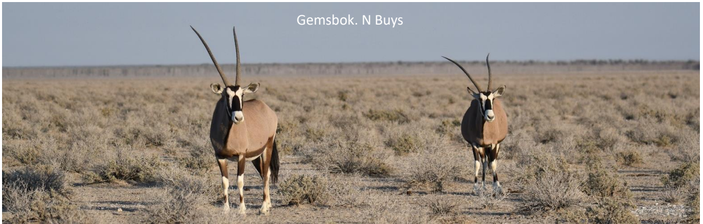
Gemsbok. N Buys

Days 11 & 12. Tuesday 1 & Wednesday 2 April 2025. Etosha South, Namibia. In the morning, we will make our way westwards, stopping at waterholes during our drive. We will have lunch at Halali camp, known for sightings of Violet Woodhoopoe, Carp's Tit, Bare-cheeked and Southern Pied Babbler, White-crested Helmetshrike, Damara Red-billed Hornbill, Greater Blue-eared Starling, African Scops Owl, and Southern White-faced Owl. If there is time, we will take a short stroll to the local waterhole to see what mammals are visiting. On our way to our next lodge at Okaukuejo camp, we may see Dusky and Scarlet-chested Sunbird, Crimson-breasted Shrike, Acacia Pied Barbet, Golden-tailed Woodpecker, Southern White-crowned Shrike,