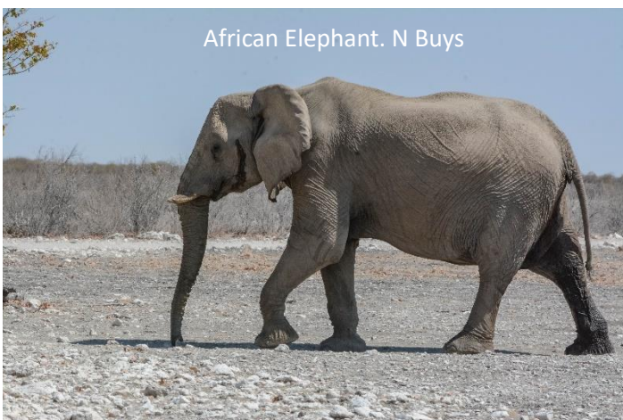
African Elephant. N Buys