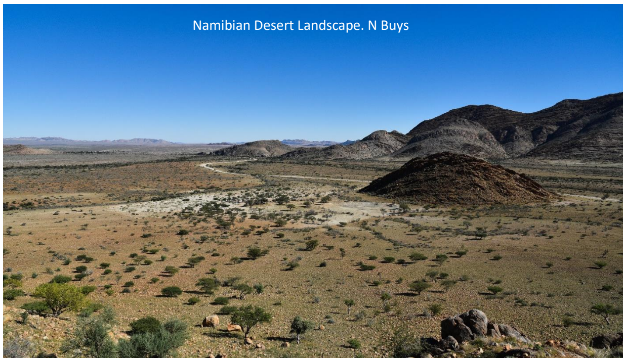
Namibian Desert Landscape. N Buys