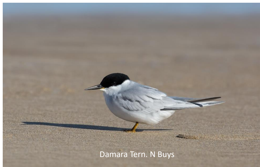
Damara Tern. N Buys

Days 16 & 17. Sunday 6 & Monday 7 April 2025. Swakopmund, Namibia. Today we travel to