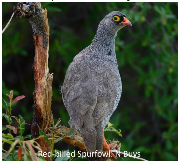
Red-billed Spurfowl. N Buys

Days 14 & 15. Friday 4 & Saturday 5 April 2025. Erongo Mountains, Namibia. We will spend the morning birding around the Brandberg, making sure we pick up all the species we still need. Then we will make our way south to the Erongo mountains. The Erongo mountains and surrounds are a real endemic