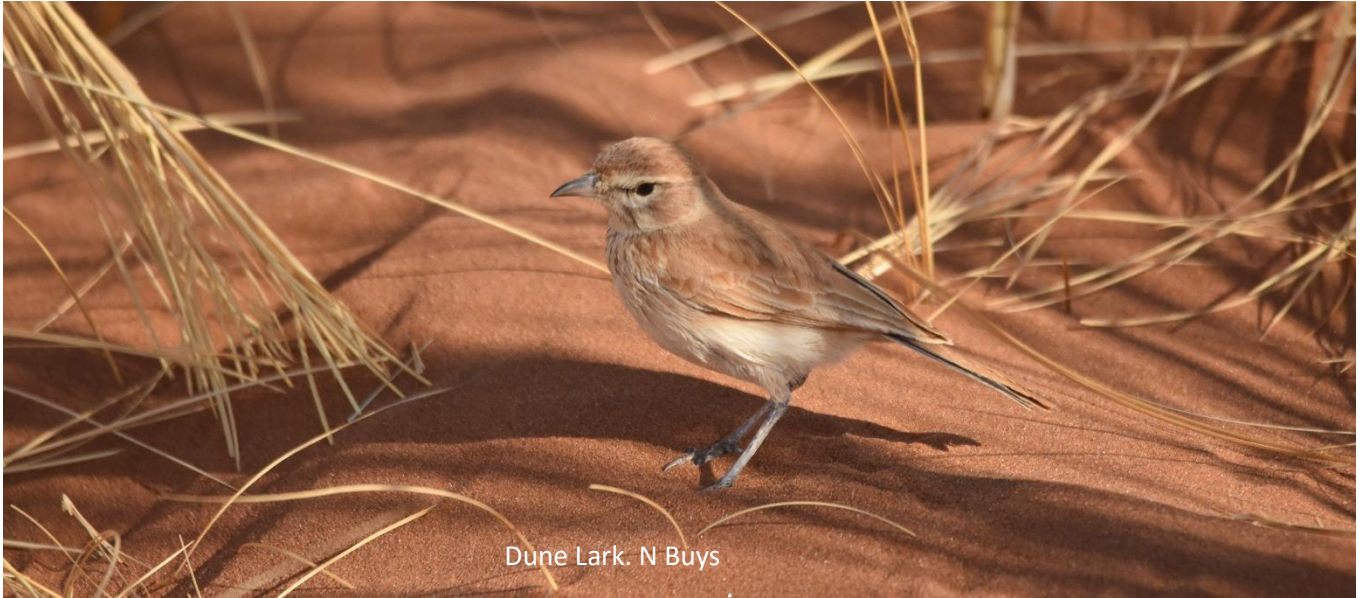
Dune Lark.

Day 18. Tuesday 8 April 2025. Windhoek. This morning, we will focus on finding Dune Lark, Namibia's only true endemic. We will spend time in the scenic Kuiseb Riverbed searching for this special bird against a