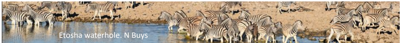
Etosha waterhole. N Buys

Day 19. Wednesday 9 April 2025. Depart Windhoek or join post-tour extension. Today we depart for our onward travels or join the Okonjima and/or Sossusvlei post-tour extensions .