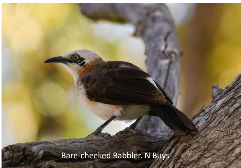
Bare-cheeked Babbler. N Buys