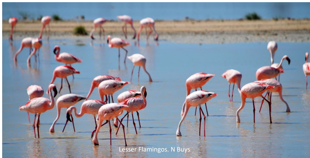
Lesser Flamingos. N Buys

include Ruff, Little Stint, Curlew Sandpiper, Black-necked Grebe, Red-necked Phalarope, Bar-tailed Godwit, Spotted Redshank, Whimbrel, Eurasian Curlew, Common, Sandwich and Caspian Terns, Eurasian and African Black Oystercatchers, Common Ringed, Chestnut-banded, Grey and Three-banded Plovers, and Greater and Lesser Flamingos. Cape Cormorants are usually spotted in huge flocks, and we will also look for Crowned and White-breasted Cormorants, and if we are lucky Bank Cormorant, an uncommon sighting among the kelp of the cold-water Benguela Current. Pomarine Jaeger and Subantarctic Skua are sometimes seen from the