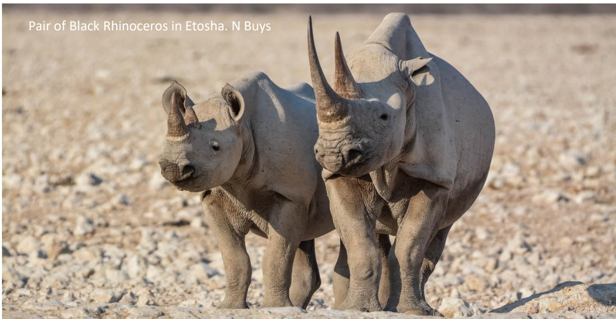
Pair of Black Rhinoceros in Etosha. N Buys

Namibia, Botswana and Zimbabwe offer some of the best birding and general wildlife viewing in all of Africa. Starting at the Zambezi River and spectacular Victoria Falls and ending on the Skeleton coast, this new tour covers a range of habitats from miombo woodland in Zimbabwe and lush riparian forest in the Caprivi and Botswana, to dune and red rock landscapes in central Namibia, and the spectacular lagoon at Walvis Bay where the desert meets the Atlantic Ocean.