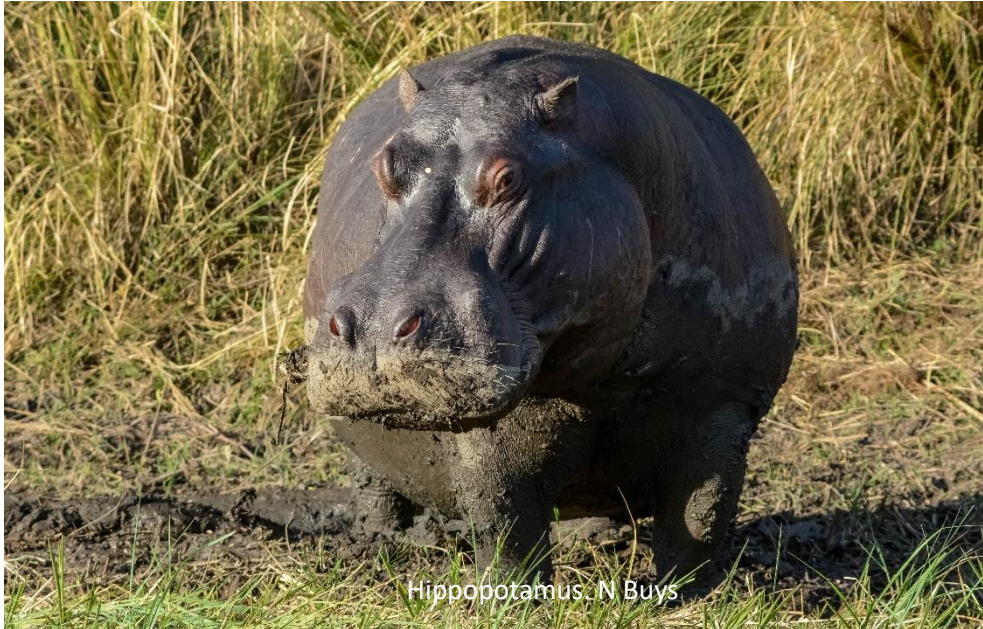
Hippopotamus. N Buys

Mahango offers excellent game viewing as well and we hope to see the rare and beautiful Sable and Roan Antelope, as well as Tsessebe, African Elephant, African Buffalo, Hippopotamus, Red Lechwe, Greater Kudu, Impala and even Lion, Cheetah, African Wild Dog or Leopard if we are very lucky. Accommodation: Safari lodge at Divundu for two nights (en suite rooms). Meals: B, L, D each day.