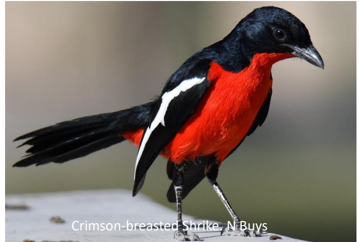
Crimson-breasted Shrike. N Buys

Marico and Chat Flycatcher, Rattling Cisticola, Double-banded and Namaqua Sandgrouse, Swallow-tailed Bee-eater, Common Ostrich, Kori Bustard, Northern Black and Red-crested Korhaan, and Great Sparrow. We will scan on top of all the huge Sociable Weaver nests for Pygmy Falcon and snakes. If there is time in the late afternoon, we will visit the Okondeka plains north of the camp to look for Spike-heeled, Pink-billed, Eastern Clapper, Red-capped and Sabota Lark, as well as Grey-backed and Chestnut-backed Sparrow-lark, Capped Wheatear, Double-banded Courser, Ant-eating Chat, Desert Cisticola, and Rufous-eared Warbler. The waterhole in this area is also famous as being the best place in the park to see Lions. Okaukuejo campgrounds are very productive, and here we can look for Crimson-breasted Shrike, Groundscraper Thrush, Pririt Batis, Chestnut-vented Warbler, Red-headed Finch, Acacia Pied Barbet, and South African