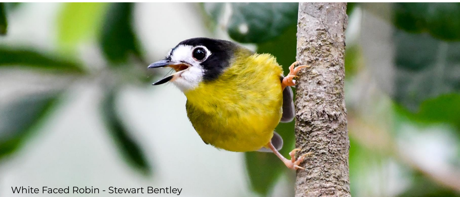
White Faced Robin - Stewart Bentley

We have 3 full days to explore this rich corner of Australia. Our time will be spent searching for the many area specials, as well as several interesting mammals and reptiles. We will bird a diverse mosaic of habitats from verdant monsoon rainforest and tropical woodland to wetlands and a variety of coastal habitats. The selection of birds is impressive with no shortage of outstanding species including two members of the Bird-of-paradise family - Magnificent Riflebird and Trumpet Manucode – and other showy species like the ear-splitting Palm Cockatoo, Red-cheeked Parrot, Eclectus Parrot, Yellow-billed Kingfisher and Frill-necked Monarch. Additional range-restricted species include White-streaked, Tawny-breasted, Graceful and Green-backed Honeyeaters, Black-eared Catbird, Yellow-legged Flyrobin, Fawn-breasted