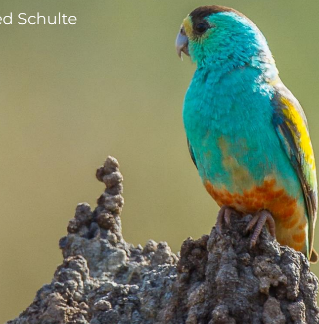
Golden-shouldered Parrot, Alfred Schulte

This tour visits some of the most remote, bird-rich areas in Australia. In the country's far north eastern corner, the distinctive Cape York Peninsula juts out into the tropical water of the Coral Sea and is home to the largest unspoilt patch of lowland rainforest on the continent. This adventure includes 4 full days birding in Kutini-Payamu (Iron Range) National Park for a host of species found nowhere else in Australia including Palm Cockatoo, Frill-necked Monarch and White-faced Robin. We also explore the riches of Rinyirru (Lakefield) National Park where Golden-shouldered Parrot and Red Goshawk will be likely highlights. Simply put, this tour is hard to beat, it covers the highlight areas in this region, and we travel at a comfortable pace. This tour is also one of our best sellers and you are welcome to join us on this next trip.