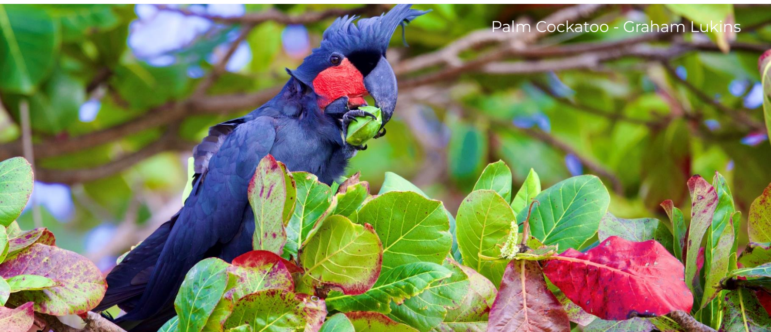
Palm Cockatoo - Graham Lukins

We have 3 full days to explore this rich corner of Australia. Our time will be spent searching for the many area specials, as well as several interesting mammals and reptiles. We will bird a diverse mosaic of habitats from verdant monsoon rainforest and tropical woodland to wetlands and a variety of coastal habitats. The selection of birds is impressive with no shortage of outstanding species including two members of the Bird-of-paradise family - Magnificent Riflebird and Trumpet Manucode – and other showy species like the ear-splitting Palm Cockatoo, Red-cheeked Parrot, Eclectus Parrot, Yellow-billed Kingfisher and Frill-necked Monarch. Additional range-restricted species include White-streaked, Tawny-breasted, Graceful and Green-backed Honeyeaters, Black-eared Catbird, Yellow-legged Flyrobin, Fawn-breasted Bowerbird, Tropical Scrubwren, Chestnut-breasted Cuckoo, Northern Scrub-robin and White-faced Robin. Additional rainforest species include Lovely Fairywren, Yellow-breasted Boatbill, Grey Whistler (subsp peninsulae ), Metallic Starling, Shining Flycatcher, Spectacled Monarch (subsp albiventris ), Barred (Yellow-eyed) Cuckooshrike, Fairy Gerygone (subsp personata ), Yellow-spotted, Brown-backed & White-throated Honeyeaters, Rufous Shrikethrush, Varied