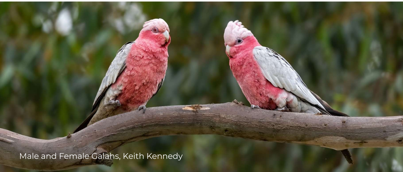
Male and Female Galahs, Keith Kennedy

Accommodation: Alice Springs (en suite). Meals included: B,L,D.