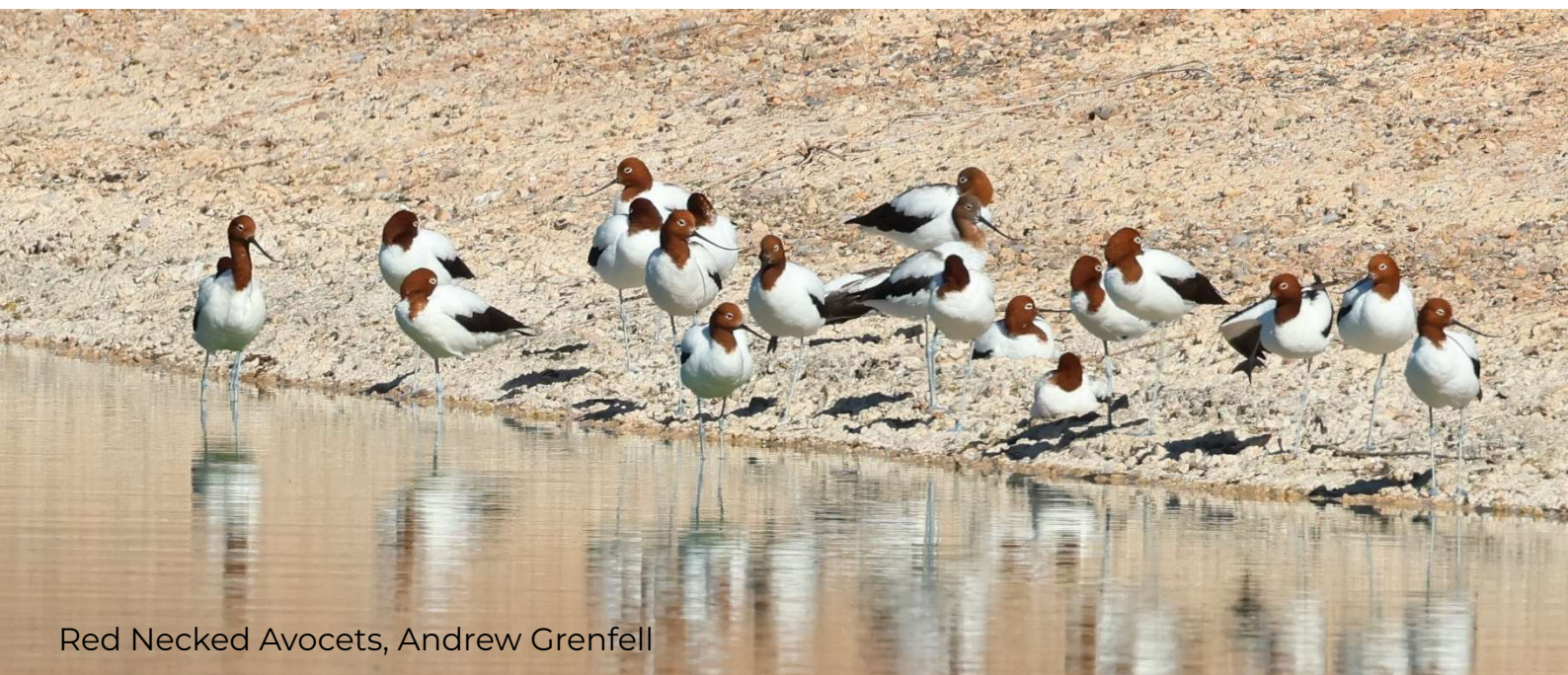
Red Necked Avocets