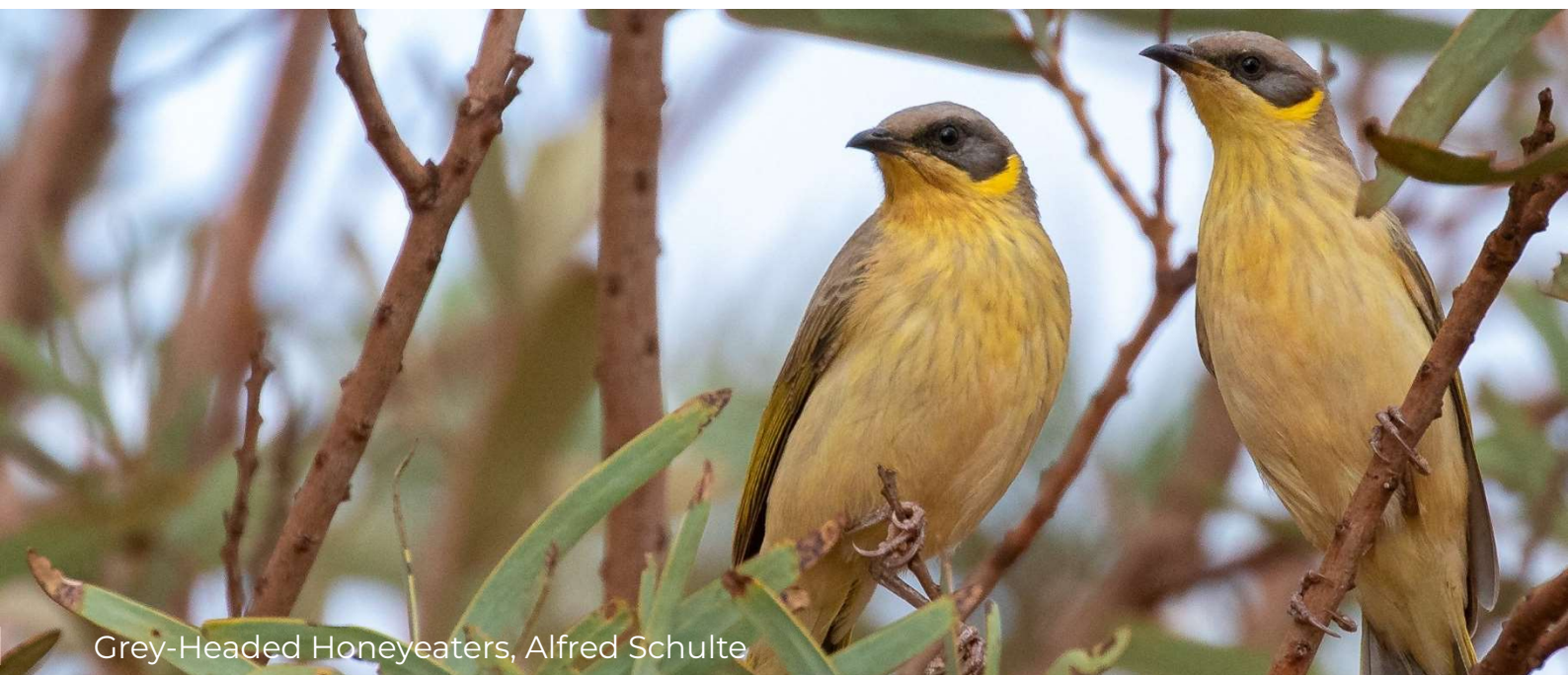
Grey-headed Honeyeaters, Alfred Schulte

Alice Springs is an excellent base from which to access a wonderful diversity of birds typical of Australia's dry country. There are a range of 'special' species to this area and in the days to come we will endeavour to track a good number of these down. We will have an early start and venture into spinifex country in search of the skulking Dusky Grasswren. This endemic Australian family is much sought after making this a fitting start to our exploration of the region. Spinifex is also home to the shy Rufous-crowned Emu-wren and dose of luck may be required if we are to get views of this lovely little bird. White-winged and Splendid Fairywrens may also be seen, as might Crimson Chat, Banded Whiteface and Red-backed Kingfisher. In the heat of the day, we will return to Alice to visit the famous Alice Springs Sewage Works, a veritable magnet for waterbirds in this thirsty landscape. Red-necked Avocet, Yellow-billed Spoonbills, and Pink-eared Duck may be seen along with more retiring species like Baillon's Crake. In the afternoon we will bird woodland areas near Alice looking for species like Grey Honeyeater, Crested Bellbird and Hooded Robin, plus the chance of rarer nomads like Black & Pied Honeyeaters, Diamond Dove, Black Falcon or even Grey Falcon. We will finish the day in at a nearby waterhole where common, but no-less-lovely species, like Red-tailed Black-cockatoo,