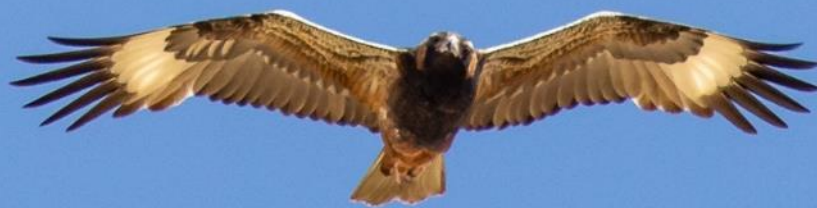
Black-breasted Buzzard.

Accommodation: Tom Price (en suite cabins) as for last night. Meals included: B, L, D.