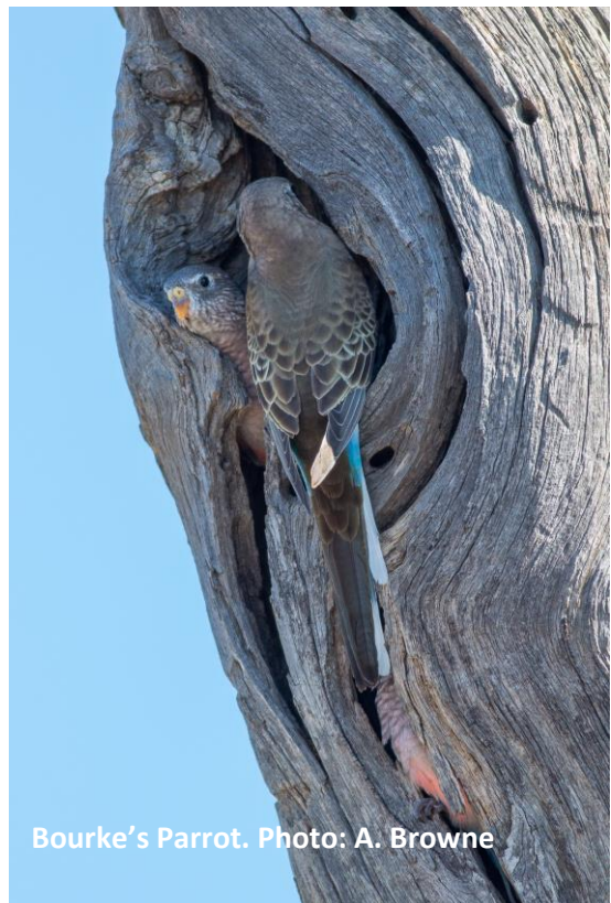
Bourke's Parrot.

Accommodation: Exmouth (en suite rooms). Meals included: B, L, D.