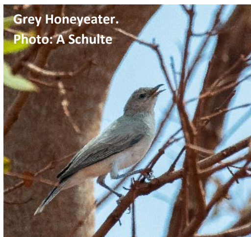
Grey Honeyeater.

Accommodation: Exmouth (en suite rooms). Meals included: L, D.