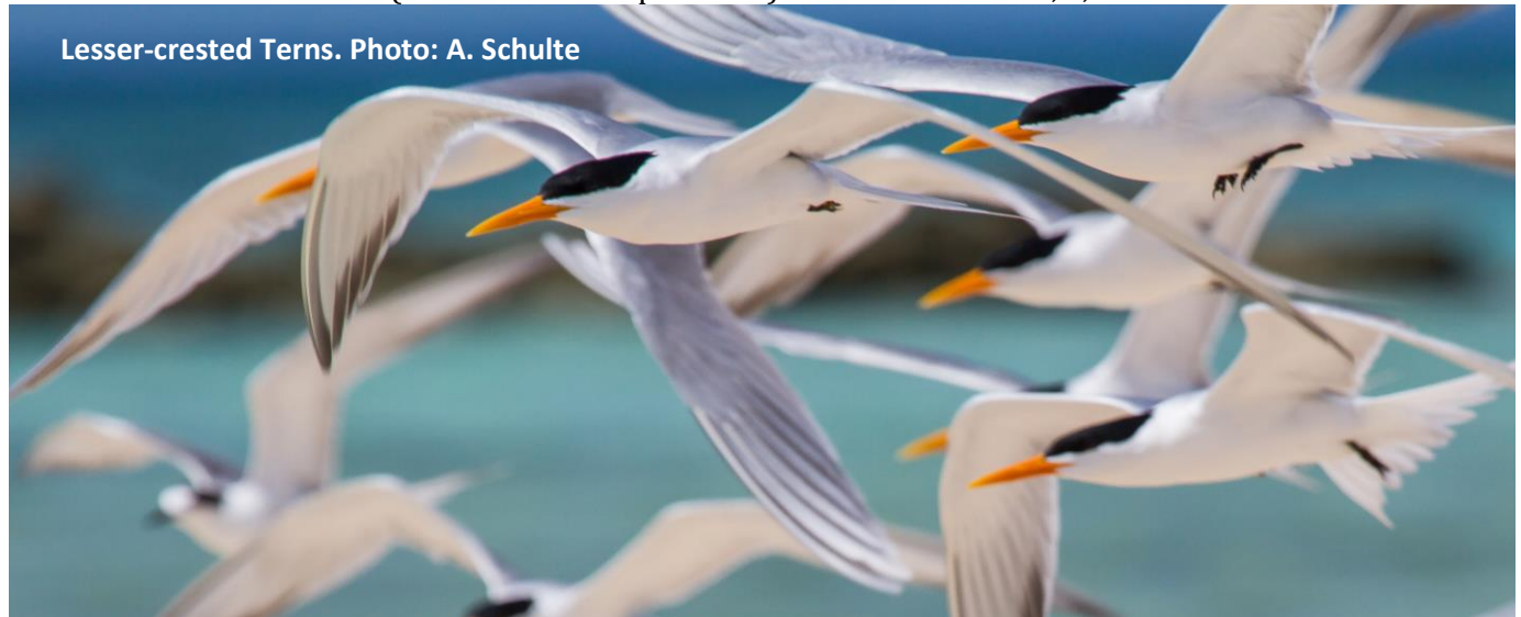
Lesser-crested Terns.

Accommodation: Denham (1 or 2 bedroom apartment). Meals included: B, L, D.