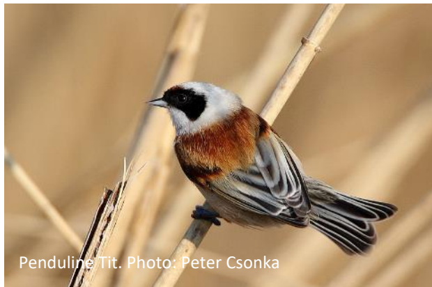
Penduline Tit.

Days 5 – 7. Durankulak to Sarafovo. Driving south we will make a stop at the oak woodland near Goritza looking