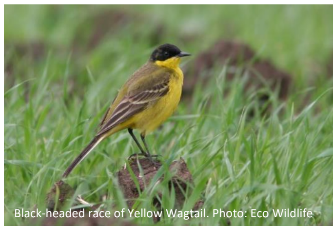
Black-headed race of Yellow Wagtail.

It takes 5-6 hours to reach our next destination, Durankulak. Our lodge is situated on the shore of the famous Lake Durankulak, thus offering great opportunities to bird from the balcony before dinner. Spanish Sparrow, Black-headed Bunting, the black-headed race of Yellow Wagtail are garden birds here. Bee-eater, Hobby, Calandra Lark, Little Owl can also be seen from our hotel.