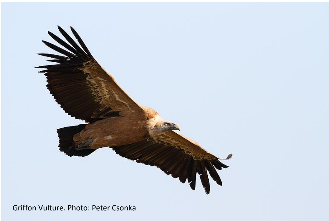
Griffon Vulture.

Beautiful landscapes, fantastic birds and friendly people, our round trip takes you to the best places in the country from the Eastern Rhodope Mountains to the Black Sea Coast.