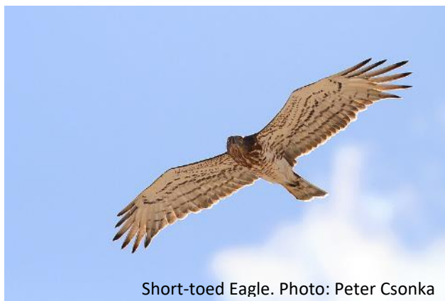
Short-toed Eagle.

The region also offers a good insight into the history of ancient Bulgaria and we shall visit nearby sites with remains of Thracian culture. One such place is the city of Perperikon. Rising 470 m above the picturesque valley of the Perpereshka River, Perperikon stands atop a rocky hill, at the heart of a lush forest. The site has been intensively excavated, revealing walls, stairs, cisterns, churches, palace buildings, a necropolis and the remains of a medieval fort. Perperikon is the biggest megalithic site in the Balkans.