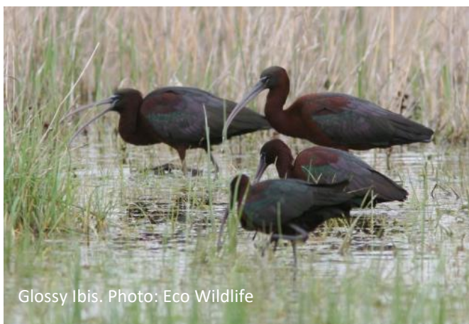
Glossy Ibis.

It is a short drive from Durankulak to the steppe country above the spectacular cliffs of Cape Kaliakra. Here, and at nearby Yailata, are the most western populations of Isabelline and Pied Wheatears as well as good numbers of Black-