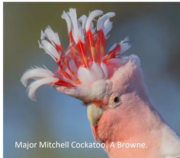
Major Mitchell Cockatoo. A Browne.

Today we continue our travels inland and North to Mount Magnet. Past Wubin we pass through an area of sand plain heath which should have extensive flowering. We will look out for Red-tailed Black-Cockatoo (race samuelyi ), Western Corella (race derbyi ), and Black-breasted Buzzard. En route to Mount Magnet we have chances Bourke's Parrot, Mulga Parrot, Banded Lapwing, Black-tailed Native-hen. If we have time, we may make a diversion to look for Grey Honeyeater, Mulga Parrot, Little Woodswallow, Orange Chat and Crimson Chat. We could get lucky and find Major Mitchell's Cockatoo. If the weather allows, we will try to access a river with a series of pools lined with thick flowering vegetation located to the south-east of Mt Magnet. We will target White-browed Treecreeper, Gilbert's Whistler, Southern Scrub-robin, Mistletoebird and any honeyeaters in the flowering vegetation. We may even have the opportunity to look for Western Quail-thrush. Tonight is the first of a two night stay in Mount Magnet. Accommodation: Mount Magnet (en suite cabin). Meals included: B, L, D.