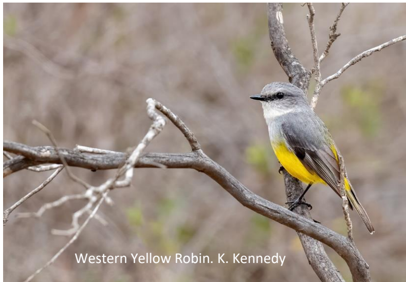
Western Yellow Robin.