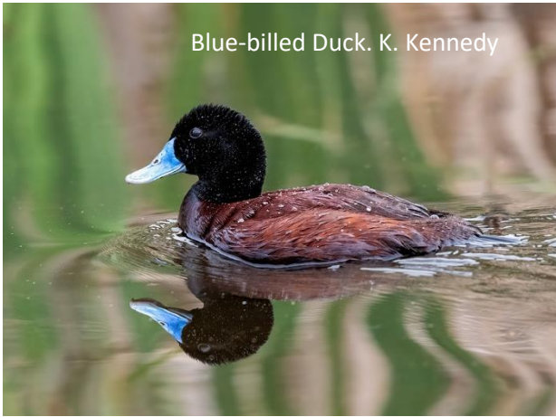
Blue-billed Duck. K. Kennedy

Today has been set aside as an arrival day so you are free to arrive at any time that suits your travel plans. You are to make your own way to the hotel (the hotel does provide a transfer service from Perth airport) and we will meet at the hotel at 7.00pm for a brief orientation and welcome dinner. Please note that no activities have been planned for today. Accommodation: Perth (en suite rooms). Meals included: D.