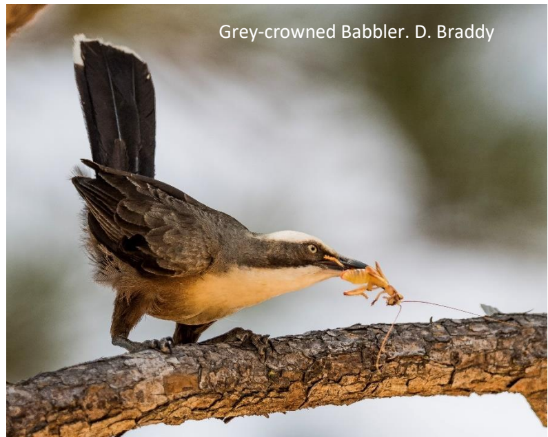
Grey-crowned Babbler. D. Braddy

We drive 1.5 hours north to Kalbarri at the mouth of the Murchison River. We will spend much of the time in the heathland of Kalbarri National Park where there should be a profusion of flowers attracting honeyeaters including the WA endemic Western Spinebill and Western Wattlebird, as well as Tawny-crowned Honeyeater, White-cheeked Honeyeater and chances of the nomadic Pied Honeyeater, Black Honeyeater and White-fronted Honeyeater. There are good chances of Blue-breasted Fairywren and Western Yellow Robin. Other birds in the area include Rufous (Western) Fieldwren ( ssp montanellus ) – a possible future split, Rainbow Bee-eater, White-plumed Honeyeater, Peaceful Dove, Hooded Robin, Southern Scrub-robin, cuckoos and a variety of raptors, hopefully including Square-tailed Kite. En route back to Geraldton, we may visit a saltworks where we may find Banded Stilt and Red-necked Avocet. Accommodation: Geraldton (en suite room). Meals included: B,L,D.