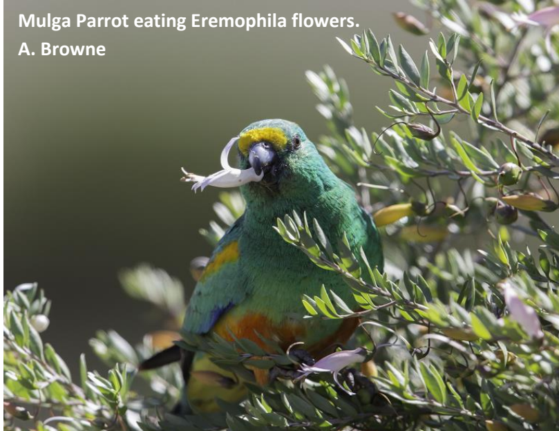
Mulga Parrot eating Eremophila flowers.