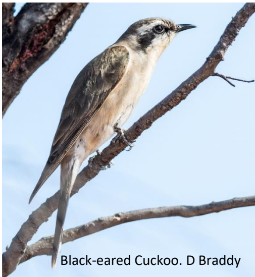
Black-eared Cuckoo. D Braddy