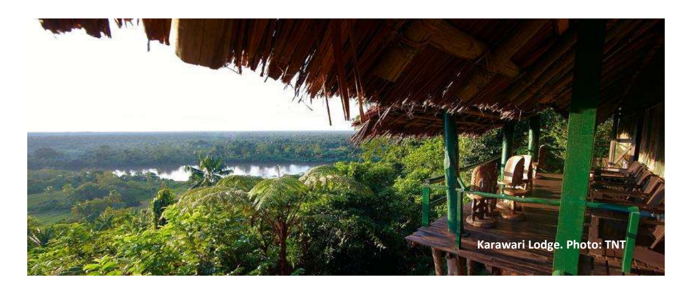
Days 7 - 9. Tuesday 2 to Thursday 4 July 2024 inclusive. Karawari area.

Accommodation : Karawari Lodge (en suite rooms). Guests are accommodated in cottages built out of local bush materials and inspired by traditional architecture. Despite its remoteness, the lodge has modern en suite bathrooms, 220V electricity, hot & cold water, comfortable mosquito-netted beds, ceiling fans, and a breezy veranda - all make for a welcome sanctuary after a day's exploration. Meals include d: B, L, D