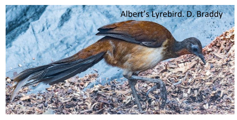
Day 3. Lamington National Park.

Today we have a full day to explore the areas further from the lodge with chances of birds like Albert's Lyrebird, White-eared & Black-faced Monarchs, Yellow-throated Scrubwren, Russet-tailed Thrush, Eastern Whipbird, Wonga, Topknot and White-headed Pigeons, Wompoo Fruit-dove, Rose, Pale Yellow & Eastern Yellow Robins and the stunning Noisy Pitta. In ridge-top woodland nearby we will hopefully connect with Glossy Black-cockatoo, Variegated Fairywren, Pacific Baza, Red-browed