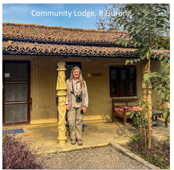
Day 8. Lumbini to Chitwan. This morning, we will drive about 4-5 hours to our homestay in a community

lodge near World Heritage Listed Chitwan National Park, aiming to arrive in time for lunch. We will then bird the lodge grounds (Greenish Warbler, Blue-bearded and Asian Green Bee-eater and other species) before exploring the village for a mix of farmland and forest birding. Species we expect to see include Alexandrine, Red-breasted and Plum-headed Parakeets, Indian Roller, Indian Grey Hornbill, Grey-capped Woodpecker, Scarlet Minivet, Black and Ashy Drongo, Whitethroated Fantail, Cinereous Tit, Rufous Treepie, Jungle Prinia, Grey-sided Bush-warbler, Yellow-eyed Babbler, Chestnutbellied Nuthatch, Indian Robin, Oriental Honey Buzzard and Indian Spotted Eagle. We will also visit a nearby river in the late afternoon where Bar-headed Goose, Little Cormorant, Osprey, groups of Little Pratincole, Sand Lark and Pied and White-breasted Kingfisher can be found in the water and on the shoreline, before returning to the lodge for a delicious