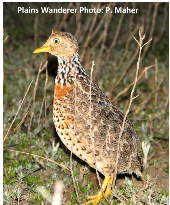
Plains Wanderer

We will have another morning in some mallee habitats to clean up a few birds we may have missed before heading further north and to the open plains on very edge of the outback. The district supports a huge range of birds including White-backed Swallow, Black Falcon, Orange Chat, Painted Honeyeater, Wedge-tailed Eagle, Greater Blue Bonnet, Southern Whiteface, Apostlebird, Grey-crowned Babbler, Striped Honeyeater, Superb Parrot, Australasian Bushlark, Brown Songlark and Spotted Harrier, and we will endeavour to catch up with most of these whilst in the area. With local guide and legend Philip Maher at the helm for our first evening, the main target after dark will be the enigmatic Plains Wanderer and depending on local conditions and/or how much rain has fallen in recent times there may be the chance of other specials like Australian Pratincole, Inland Dotterel, Stubble Quail and Banded Lapwing. Nocturnal birds feature as well, and we could pick up Barn Owl, Southern Boobook, Australian Owlet-nightjar and Tawny Frogmouth. Mammals here range from the mighty Red Kangaroo, Western Grey Kangaroo, Common Brushtail Possum and tiny Fat-tailed Dunnart. Accommodation: Deniliquin (en suite rooms) for 2 nights. Meals included: B, L, D both days.