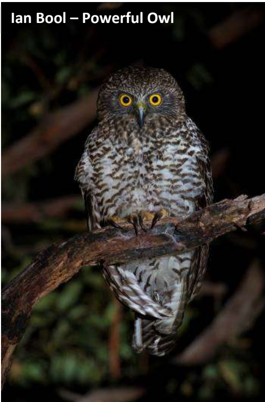
Ian Bool – Powerful Owl