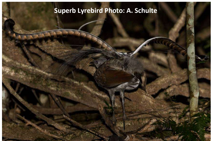
Superb Lyrebird

Accommodation: none. Meals included: B, L.