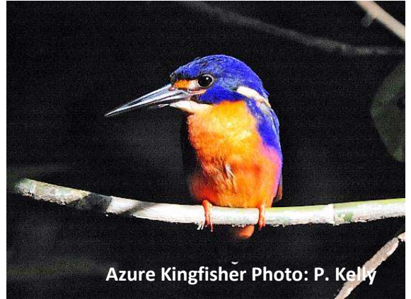
Azure Kingfisher

Today we will have a more relaxed departure after what will probably be a late night the previous evening, and so with a bit of travel day birding will be limited as we head south back into Victoria. Along the way we will have a look at some of the wetlands in the red gum forests of the Riverina and hope to connect with the rare Square-tailed Kite, Australasian Bittern and Black-backed Bittern, plus another chance of Superb Parrot. Further south we will stop at some heathy woodland and look for Spotted Quail-thrush, Chestnut-rumped Heathwren, Scarlet Robin, Speckled Warbler and Leaden Flycatcher.