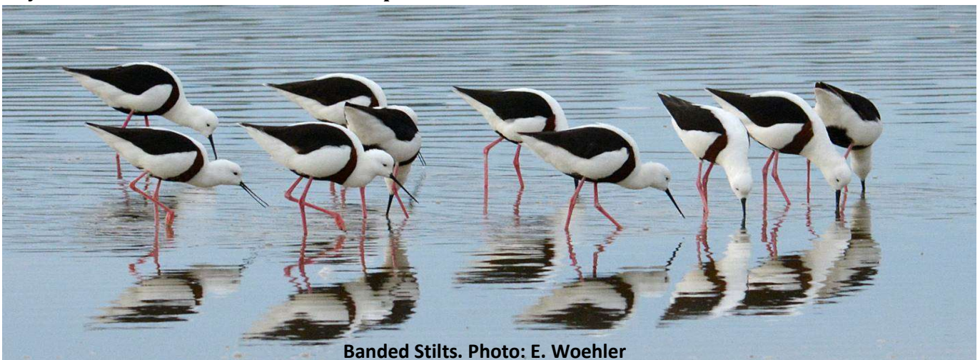
Banded Stilts.

Day 10. Healesville to Melbourne and depart.