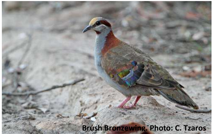
Brush Bronzewing.

Moving north today, we will make our way towards the drier woodlands of central Victoria. Here predominately box-ironbark woodlands and mallee heath vegetation communities harbour a number of bird species that are not found closer to Melbourne and are typical of the mallee regions in the far north-west of the state. Birds to expect here include Crested Bellbird, Gilbert's Whistler, Shy Heathwren, Purple-backed Fairy-Wren,