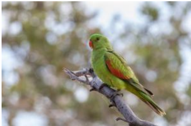
Red-winged Parrot - Alfred Schulte

Accommodation: near Boodjamulla National Park (en suite cabins). Meals included: B, L, D.