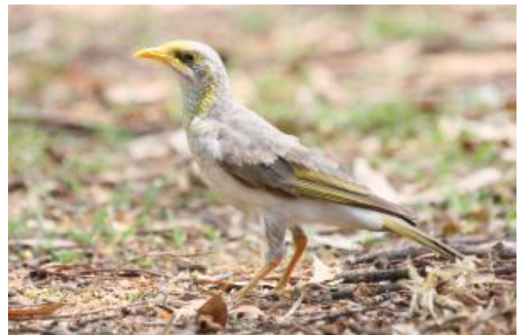
Yellow-throated Miner - Bob Lewis

Day 15. Sunday 21 July 2024. Depart Cairns. Depart Cairns this morning. Accommodation: none. Meals Included: B