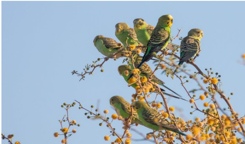
Budgerigars - Alfred Schulte

Click here for a separate online doc that answers many of the frequently asked questions about Small Group Tours