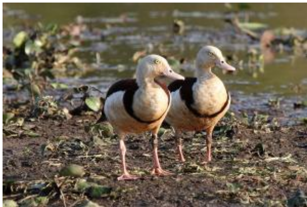
Radjah Shelduck

Day 3. Tuesday 9 July 2024. Georgetown to Karumba. This morning we'll have a look around a dam near Georgetown which is famous for the finches that come to drink early morning. Here we hope to connect with Black-throated, Masked, Plum-headed (rare), Zebra & Double-barred Finches, as well as Pictorella & Chestnut-breasted Mannikins and the very rare Gouldian Finch if we're really lucky. Other woodland birds here include