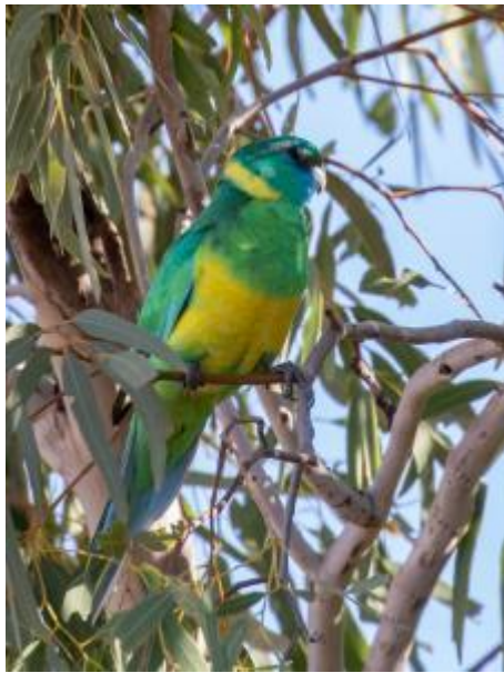
Cloncurry Ringneck Alfred Schulte

Day 10. Tuesday 16 July 2024. Mount Isa area. Our target today will be the critically endangered Carpentarian Grasswren, and in order to see this bird we'll need to drive north west of Mount Isa to a well-known location for this increasingly difficult to find species. We'll try in several locations along the route and with some good fortune will have found the bird before the heat of the day kicks in. Other species here include Grey-headed Honeyeater, Painted Finch, Hooded Robin and Square-tailed Kite. Travel back to Mt Isa for lunch plus some more birding in the region. Additional chance of Kalkadoon Grasswren if needed. Accommodation: Mount Isa (en suite rooms). Meals included: B, L, D.