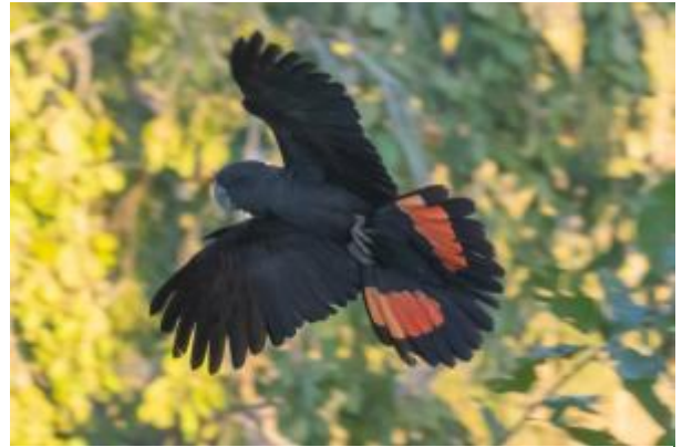
Red-tailed Black Cockatoo - Karen Dick

Day 2. Monday 8 July 2024. Cairns to Georgetown. This morning we will depart Cairns and head across the lush Atherton Tablelands into the drier country towards Georgetown. West of the Tablelands, the annual rainfall drops dramatically, and the rainforests and rich arable land turn give way to open woodland and tropical savannah, with a few isolated patches of vine thicket, a relict semi-evergreen forest that survives in areas protected from fire. Birds we'll hope to see en route include Red-tailed Black-cockatoo, Apostlebird, Cockatiel, Spotted Harrier, Wedge-tailed Eagle, Emu, Brown-backed Honeyeater, Dollarbird, Brown Treecreeper and White-throated Honeyeater. We will stay overnight in Georgetown, once a bustling Gold Rush town but now a quiet farming community Accommodation: Georgetown (en suite motel rooms). Meals included: B, L, D.