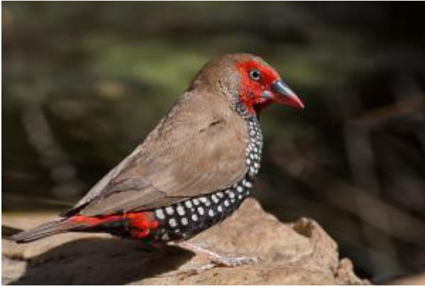
Painted Finch - Andrew Browne

Day 10. Tuesday 16 July 2024. Mount Isa area. Our target today will be the critically endangered Carpentarian Grasswren, and in order to see this bird we'll need to drive north west of Mount Isa to a well-known location for this increasingly difficult to find species. We'll try in several locations along the route and with some good fortune will have found the bird before the heat of the day kicks in. Other species here include Grey-headed Honeyeater, Painted Finch, Hooded Robin and Square-tailed Kite. Travel back to Mt Isa for lunch plus some more birding in the region. Additional chance of Kalkadoon Grasswren if needed. Accommodation: Mount Isa (en suite rooms). Meals included: B, L, D.