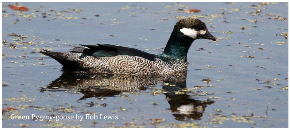
Green Pygmy-goose by Bob Lewis

Accommodation: Travelodge Resort Darwin (en suite hotel room). Meals included: B, L, D