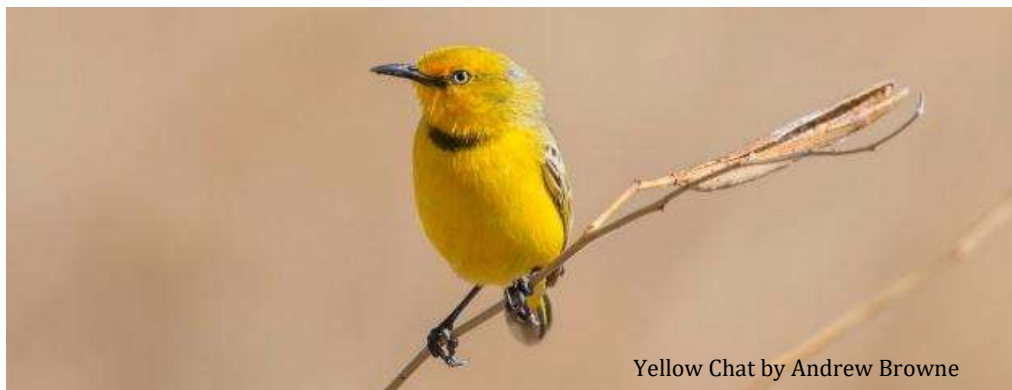
Yellow Chat by Andrew Browne

Today we begin our journey west across the Top End. En route we have additional chances for Hooded Parrot and with luck, we may see the uncommon northern race of Crested Shrike-tit. We will explore the cane-grass habitat on the fringes of the Victoria River for the lovely Purple-crowned Fairy-wren and Yellow-rumped Mannikin. Freshwater Crocodiles are common here and, unlike their saltwater cousins, subsist mostly on fish, and thus pose little threat to large mammals (humans included!). Other possible species today include Red-tailed Black-cockatoo, Cockatiel, Rufous-throated, Black-chinned and Banded Honeyeaters and Buff-sided Robin. Accommodation: Timber Creek Hotel (en suite room). Meals included: B, L, D.