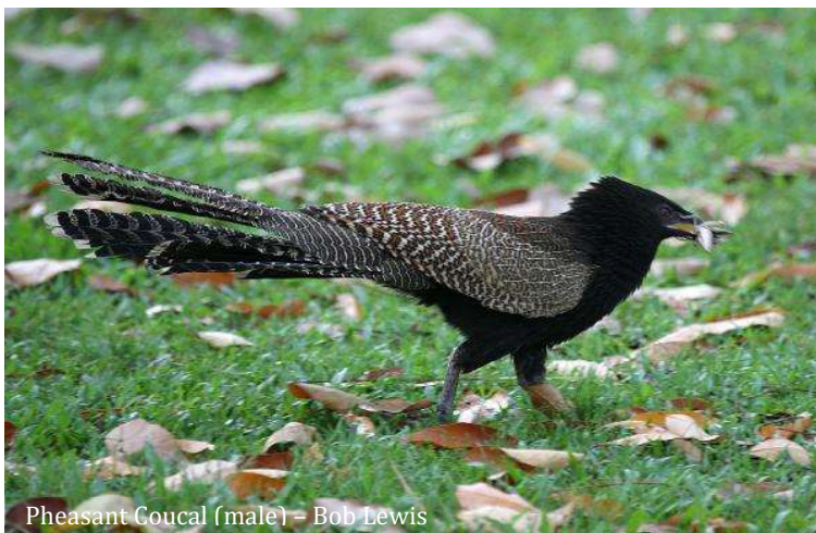
Pheasant Coucal (male) – Bob Lewis

This morning we will visit Ubirr, a site of typical Arnhemland Escarpment rock outcrops, that is home to some impressive aboriginal rock art. The art depicts creation ancestors and animals of the area, including several fish and turtle species, wallabies and possums. Hopefully Wilkin's Rock Wallabies (a relatively recent split from Short-eared Rock Wallaby) may be present in the shade of the rocks, and birds we may see here include Sandstone Shrike-Thrush & Chestnut-quilled Rock Pigeon. Elsewhere throughout the park we'll hope to connect with tropical woodland species like Partridge Pigeon (red eyed form), Rainbow Bee-eater, Black Bittern, Long-tailed Finch and Rufous-throated Honeyeater. We will spend the afternoon in the Jabiru area of Kakadu which will include a visit to the Bowali Information Centre where an interpretive walk-through display explains in some detail the cultural heritage and natural history of the Gagadju (Kakadu) region. The Bininj-Mungguy indigenous culture dates back tens of thousands of years and there are some fascinating insights there at the centre; the surrounding grounds provide a good chance to see a range of birds. After dinner if we're feeling energetic, we can spotlight for mammals like Black-footed Tree-rat and Savannah (Sugar) Glider. After dinner if we're feeling energetic, we can spotlight for mammals like Black-footed Tree-rat and