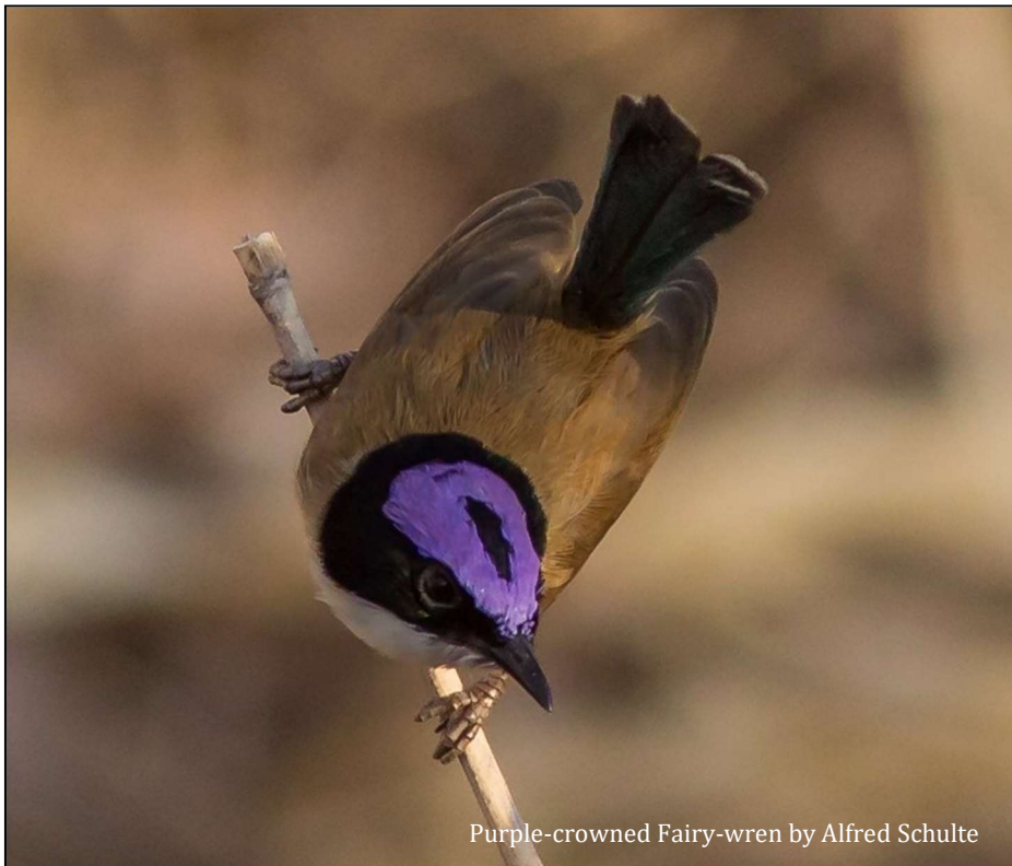
Purple-crowned Fairy-wren by Alfred Schulte

Itinerary updated by Dt Tonia Cochran, Inala Nature Tours 2 February 2023