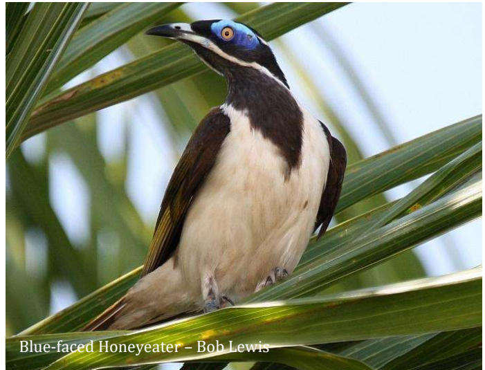
Blue-faced Honeyeater - Bob Lewis

Around 200 species of birds including range-restricted species like Hooded Parrot, Rainbow Pitta, Banded Fruit Dove, Sandstone Shrike-thrush, White-quilled and Chestnut-quilled Rock-pigeon, Gouldian Finch and Yellow Chat. Sought-after mammals include Short-eared and Wilkin's Rock-wallaby, Antilopine and Black Wallaroo, Black Flying-fox and Dingo. Enjoy Kakadu's vast wetlands, the Kimberley including Lake Argyle, as well as spectacular scenery, indigenous rock art and amazing boab trees ( Adansonia gregorii ).