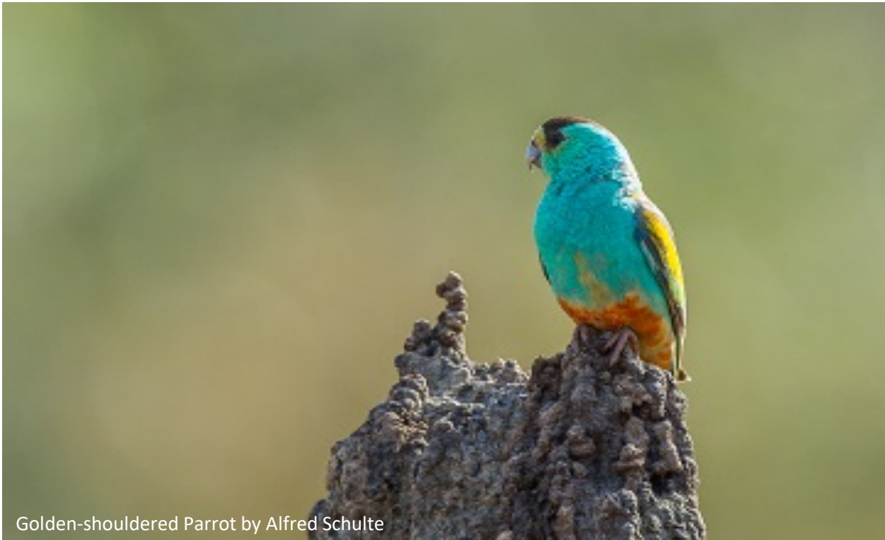
Golden-shouldered Parrot by Alfred Schulte