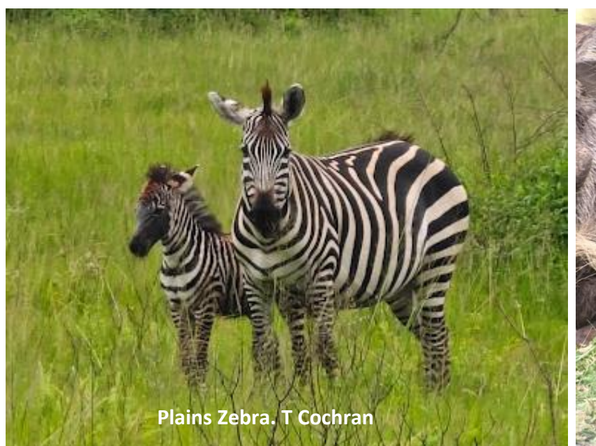
Day 13. Bwindi to Lake Mburo NP. Lake Mburo National Park is a gem. Although it is just 370 sq km in size, its landscapes are varied and even a short drive is alive with interest and colour. It is the only National Park in Uganda to contain Impala and the only one in the rift region to host Plains Zebra and Eland. In Uganda, Topi are only found in Lake Mburo and Queen Elizabeth National Parks. Other common wildlife species include Common Warthog, African Buffalo, Oribi and Defassa Waterbuck.