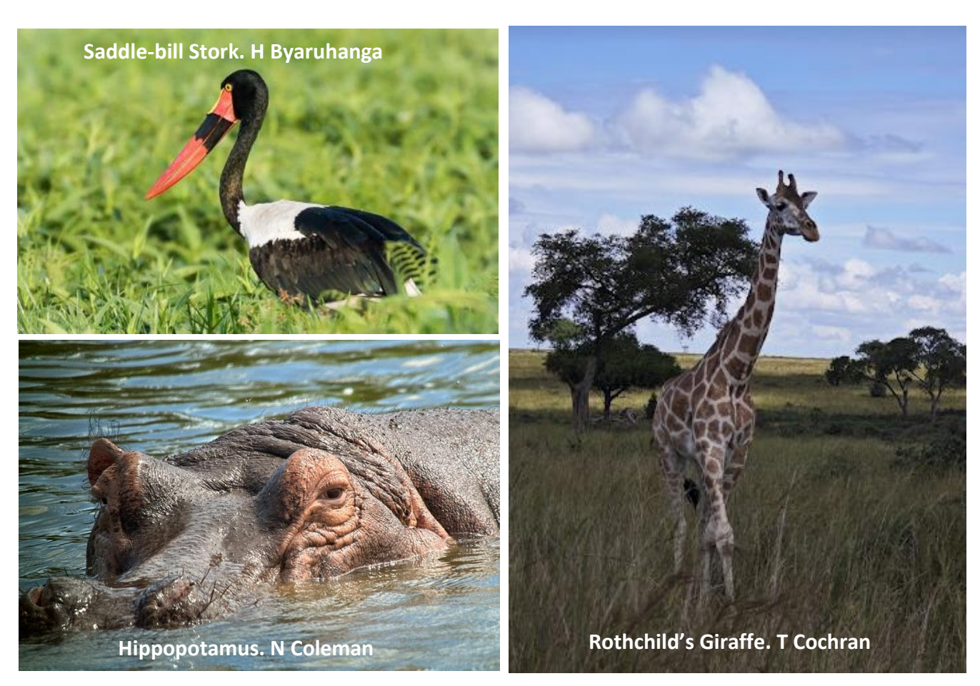
Day 5. Murchison Falls to Masindi. After breakfast we shall cross the Murchison River and drive to Masindi through the escarpment. We shall also pass through a section of Budongo Forest Reserve which is a good location for species such as the Rufous-crowned Eremomela, Chocolate-backed Kingfisher, Ituri Batis, Puvel's Illadopsis, Lemon-bellied Crombec, White-thighed Hornbill and many more. Accommodation: Hotel in Masindi (en suite rooms). Meals: B, L, D.