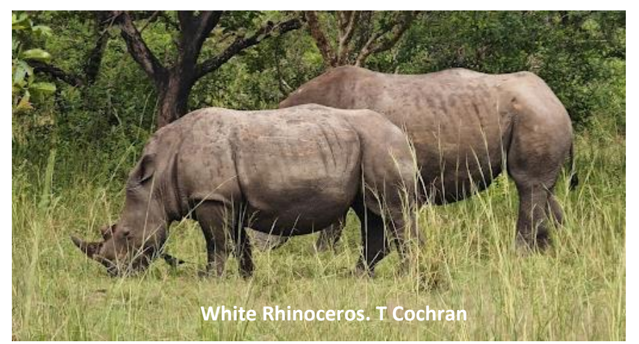
Day 3. White Rhinoceros tracking and Murchison Falls National Park. After breakfast, we will spend

some time tracking Southern White Rhinoceros in a reserve that is home to the only wild population in Uganda. This is an amazing chance to see these animals at close range and learn about the amazing efforts to conserve and breed them. The entry fee contributes directly to the maintenance expenses of this conservation program. The sanctuary is also home to 340 bird species, including Bronze-tailed, Ruppell's and Purple-headed Starling, Bruce's and African Green Pigeons, Northern Crombec African